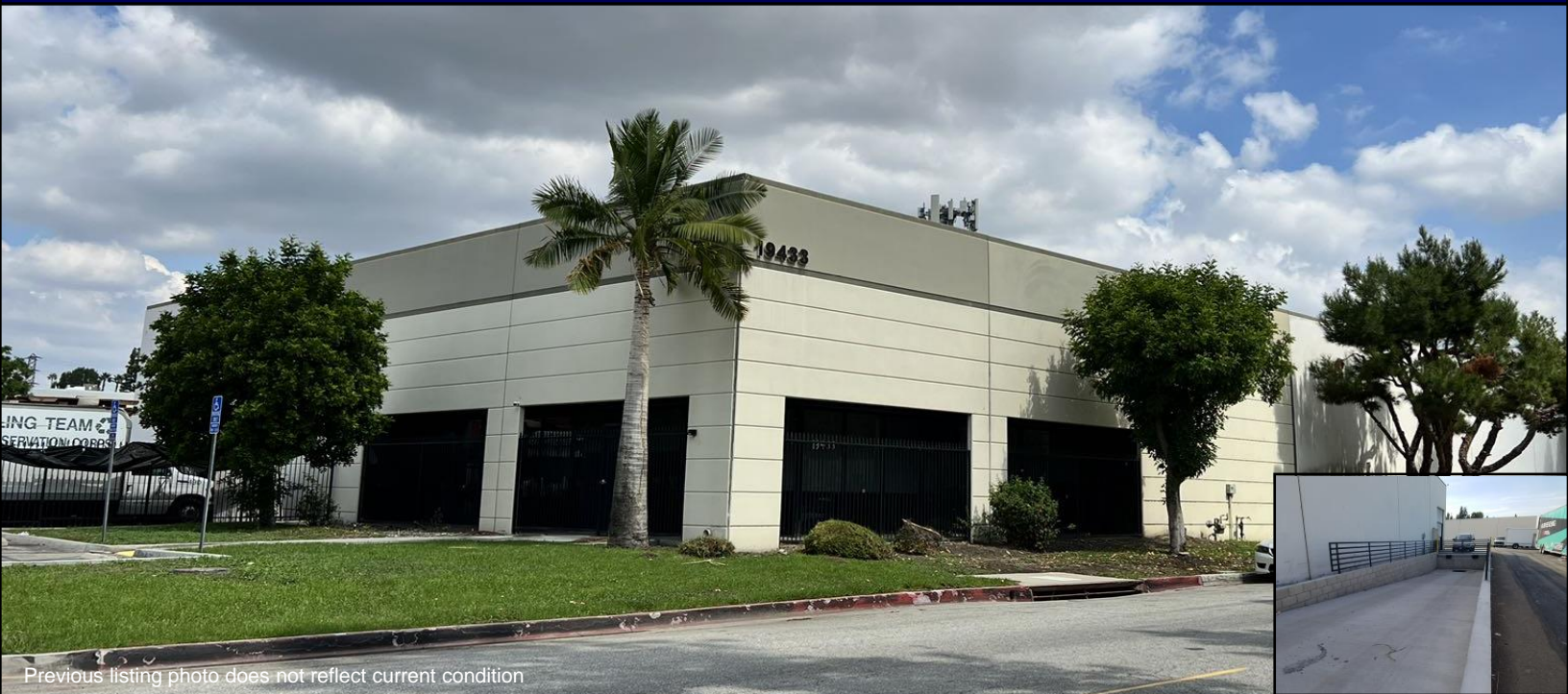
Previous listing photo does not reflect current condition

19433 San Jose Avenue City of Industry, CA