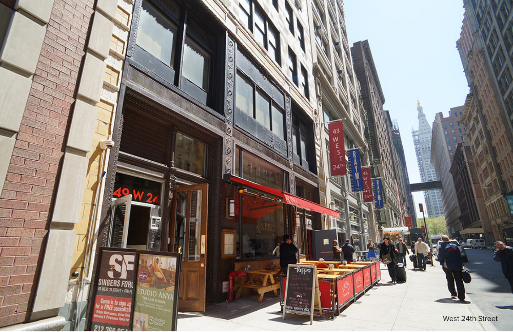
West 24th Street