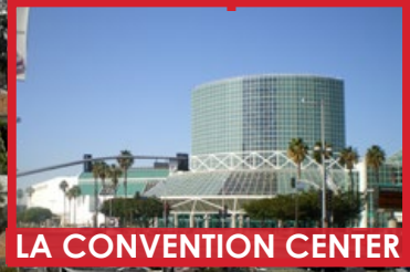
LA CONVENTION CENTER