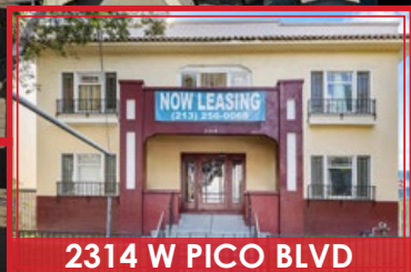
2314 W PICO BLVD