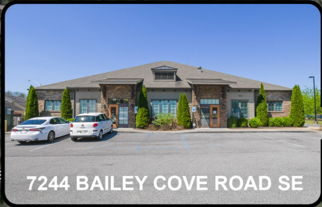
7244 BAILEY COVE ROAD SE