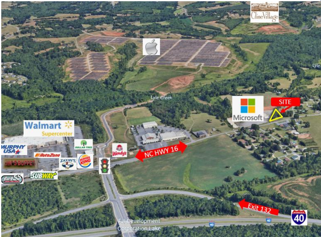
Microsoft Data Center

Convenient to surrounding amenities such as retail, restaurants, Rock Barn golf & spa and schools.