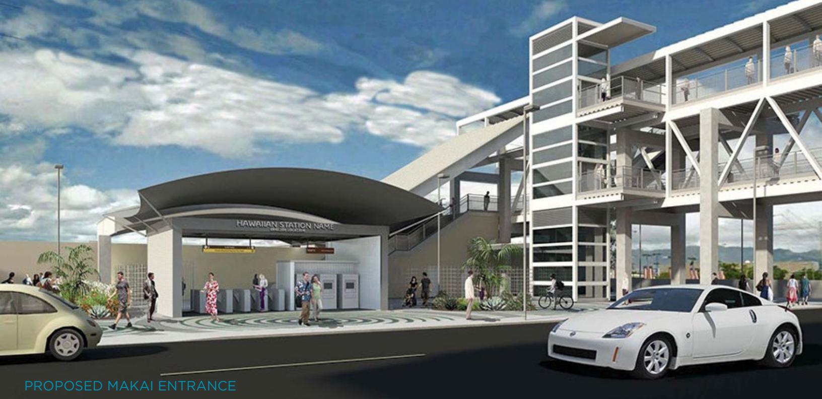
PROPOSED MAKAI ENTRANCE