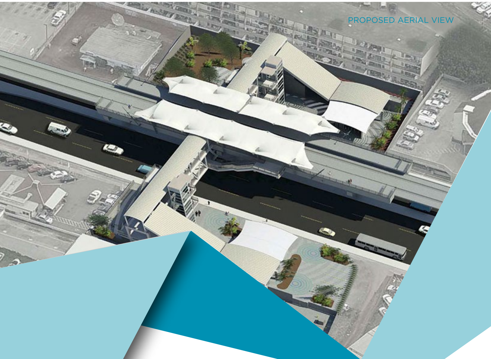
PROPOSED AERIAL VIEW