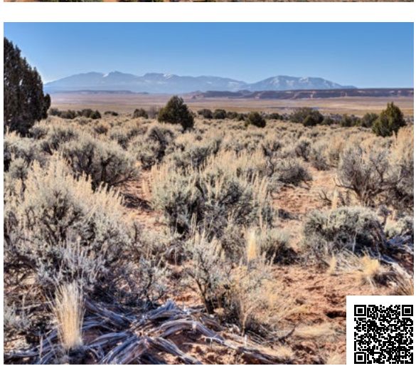
1 PHASE 2 JOE WILSON DR MLS 1973471

THE BRIGHTEST FUTURE! Fully platted and engineered Phase 2 of Wilson Arch Resort Community, located a convenient 20 minutes from Moab between two National Parks, two mountain ranges, near State Parks, and surrounded by endless recreation- including the spectacular climbing area- Indian Creek. 73 acreage lots all designed for the best home sites, greatest views, and beautiful desert living. Amazing setting between the washes and red cliffs, abutting BLM public land and public 4x4 and hiking trails. All CC&Rs, HOA bylaws, and will serve for water and septic are in place. Be the developer with the vision to take the next phase of Wilson Arch to the market!