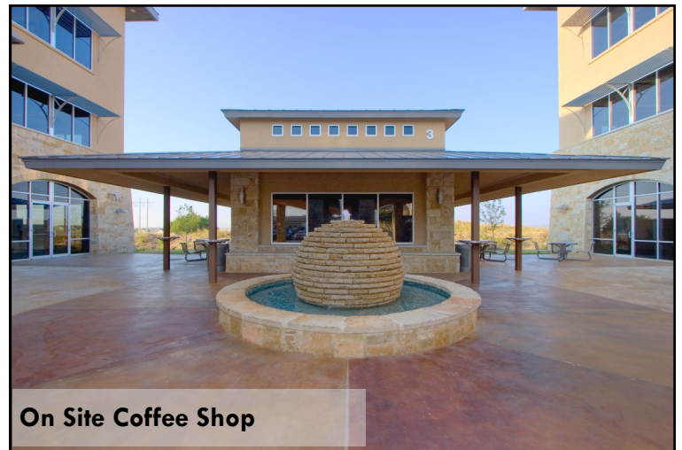
On Site Coffee Shop

CONTACT US FOR MORE INFORMATION ABOUT THIS PROPERTY: