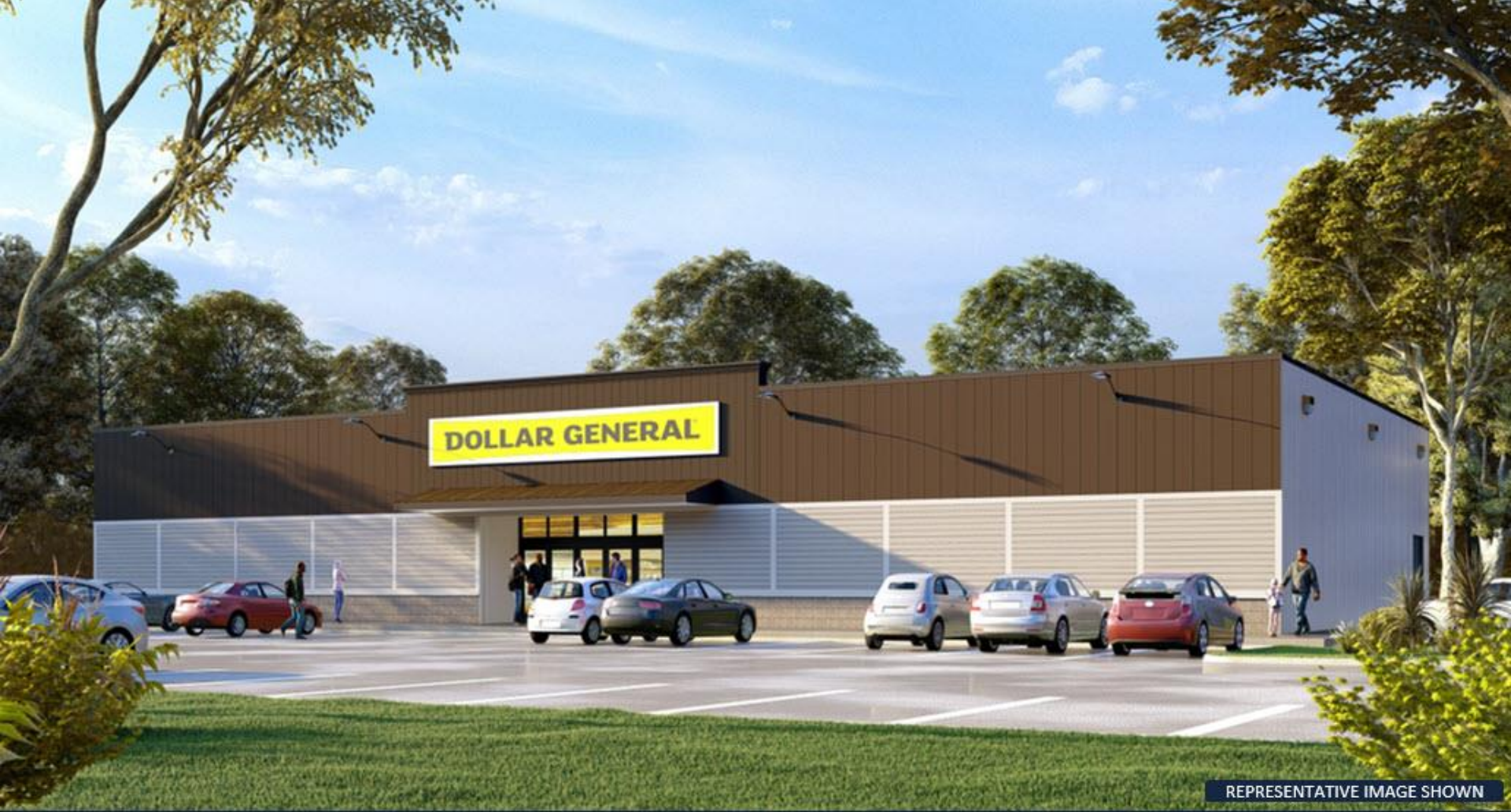
REPRESENTATIVE IMAGE SHOWN