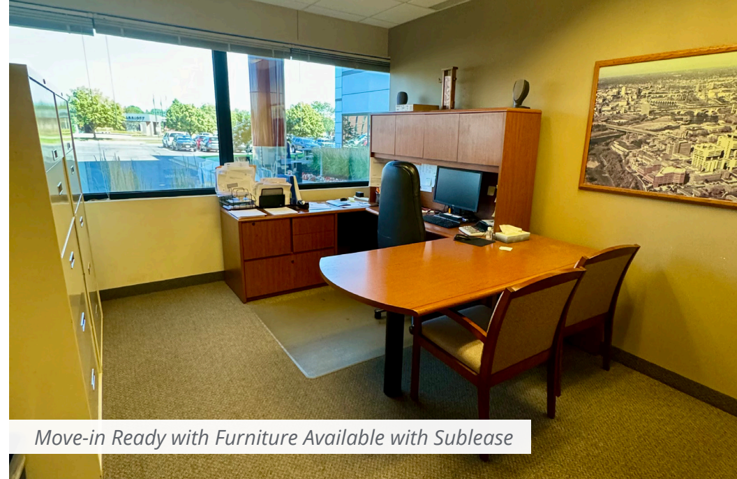
Move-in Ready with Furniture Available with Sublease