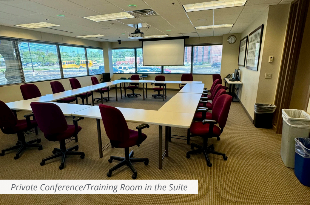
Private Conference/Training Room in the Suite