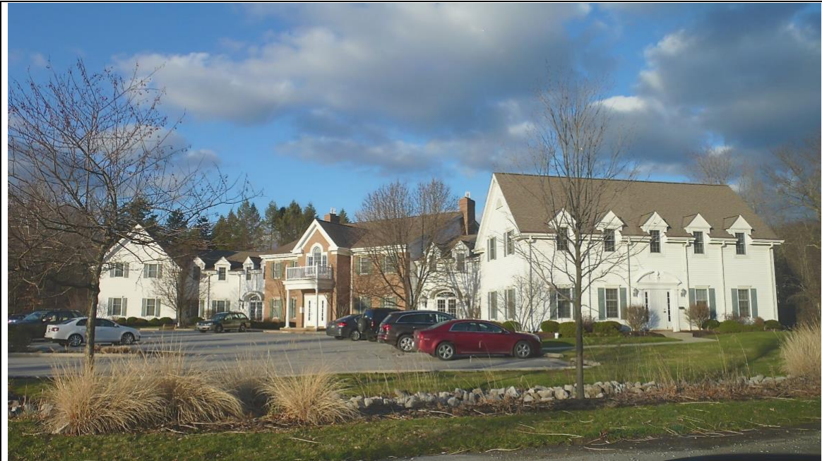
Boardwalk II – View from South