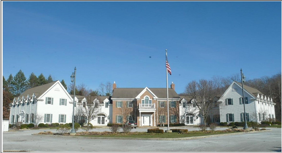
Boardwalk II – Facade View