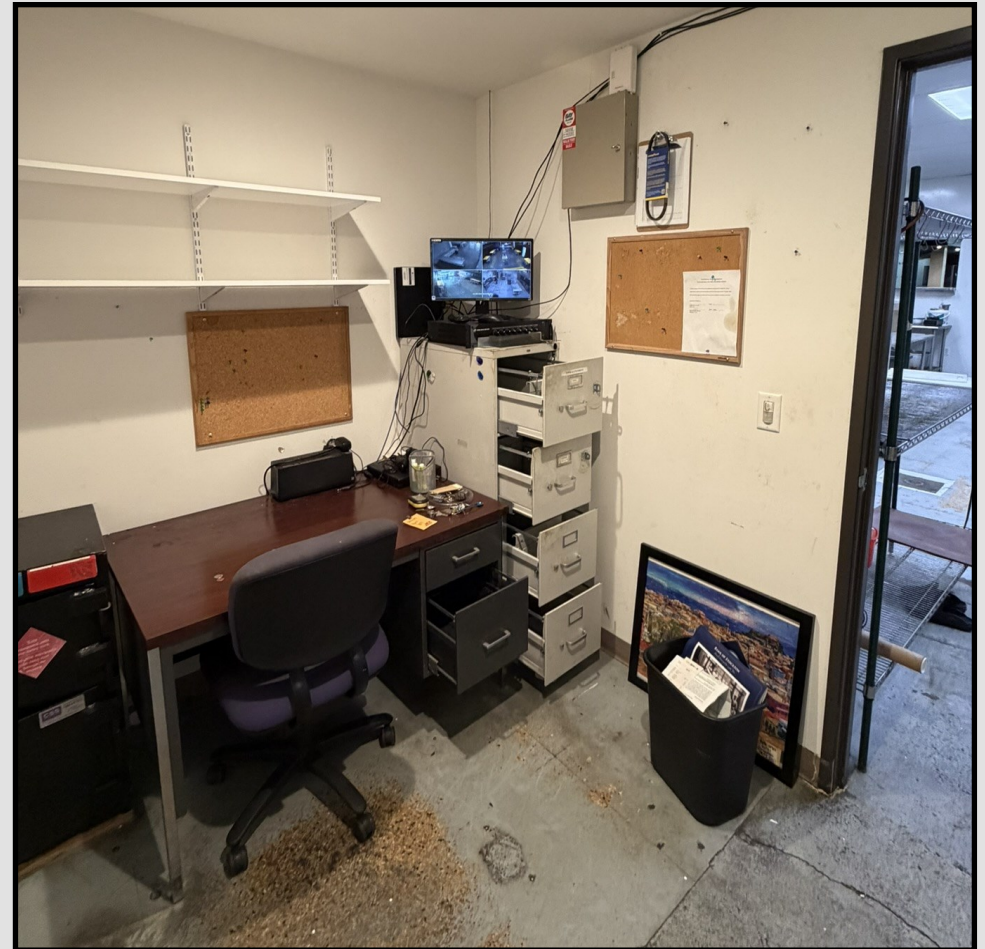
Office space with desk, camera system & safe