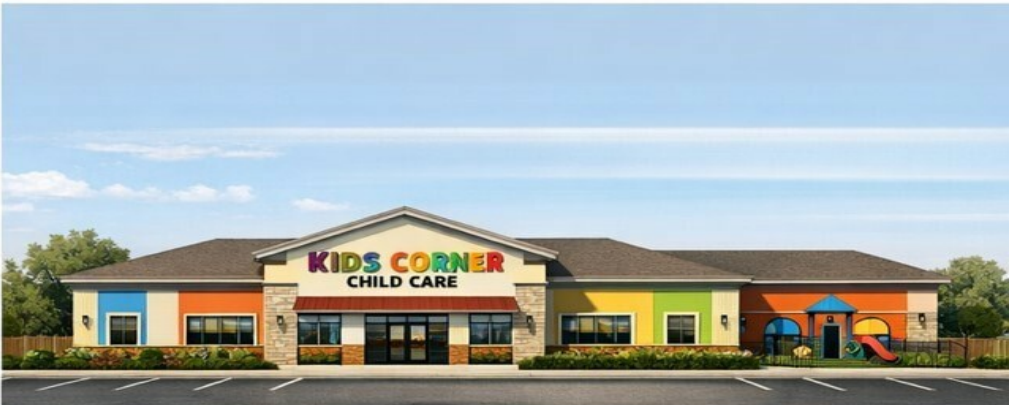
CHILD CARE CENTER ELEVATION