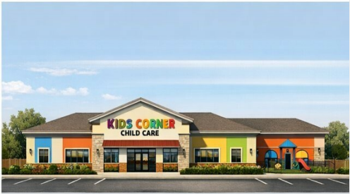
CHILD CARE CENTER ELEVATION