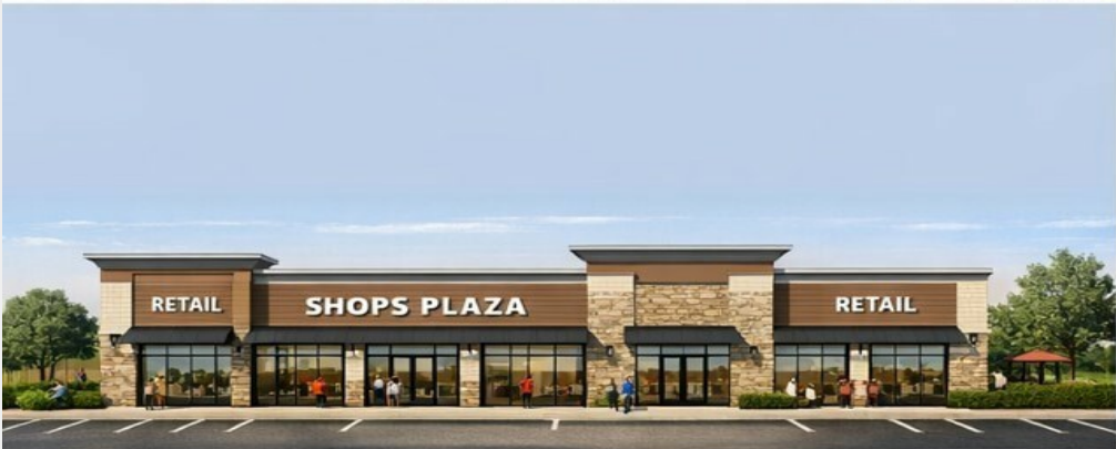
STRIP CENTER ELEVATION