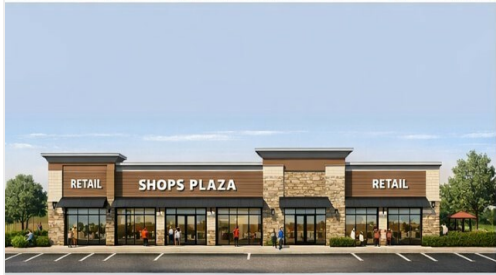
STRIP CENTER ELEVATION