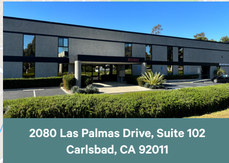
2080 Las Palmas Drive, Suite 102 Carlsbad, CA 92011