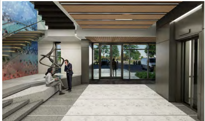
LOBBY FINISH RENDERINGS