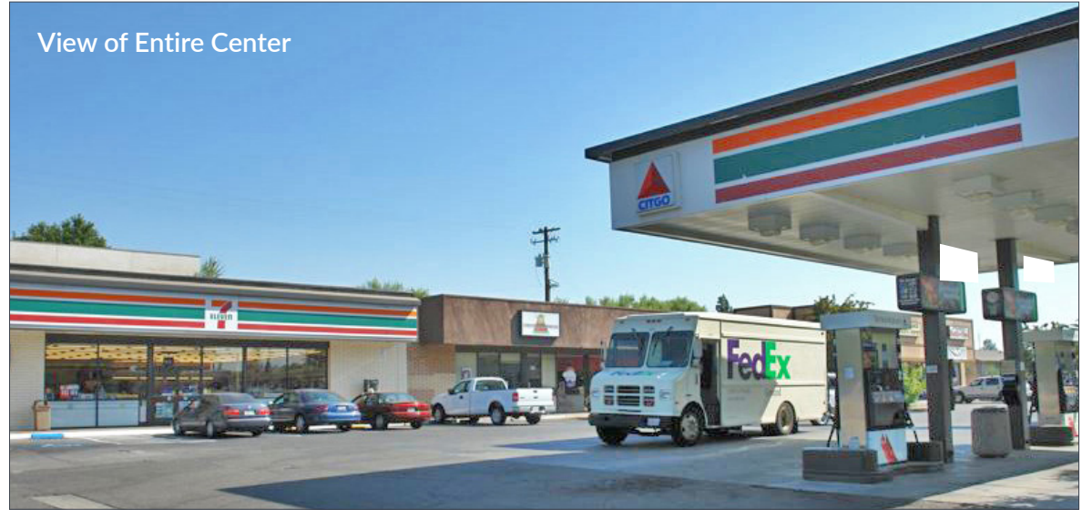
View of Entire Center

Prospective tenants are hereby advised that all uses are subject to City approval.