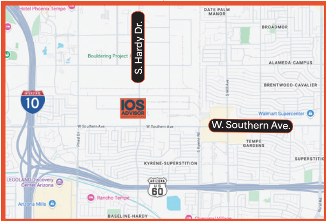
Easy Freeway Access (US-60 & I-10)