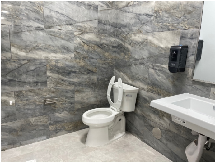
Unisex Restrooms (2)