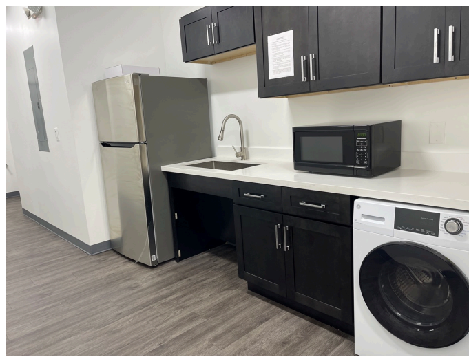
Galley Style Break Area Fridge, Sink, Microwave Washing Machine / Dryer