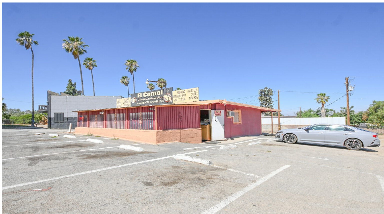
Side of Restaurant