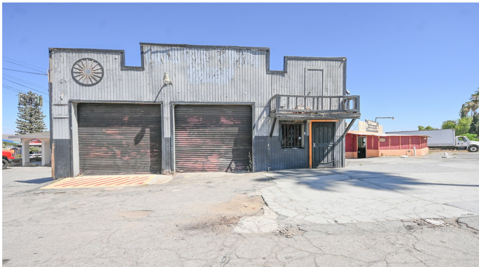
Front of Shop Structure