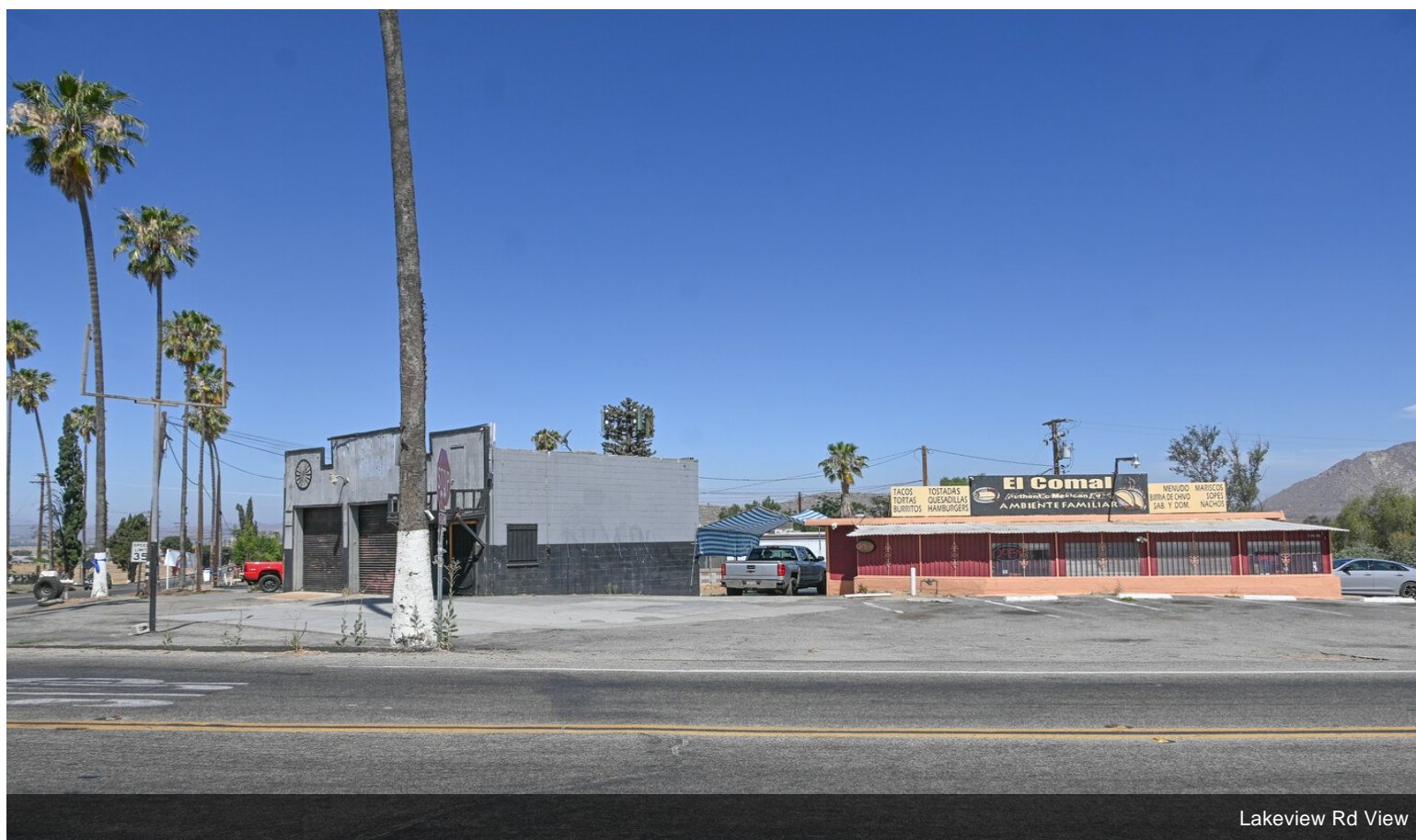
Lakeview Rd View