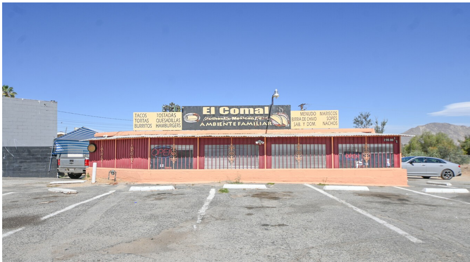
Front of Restaurant