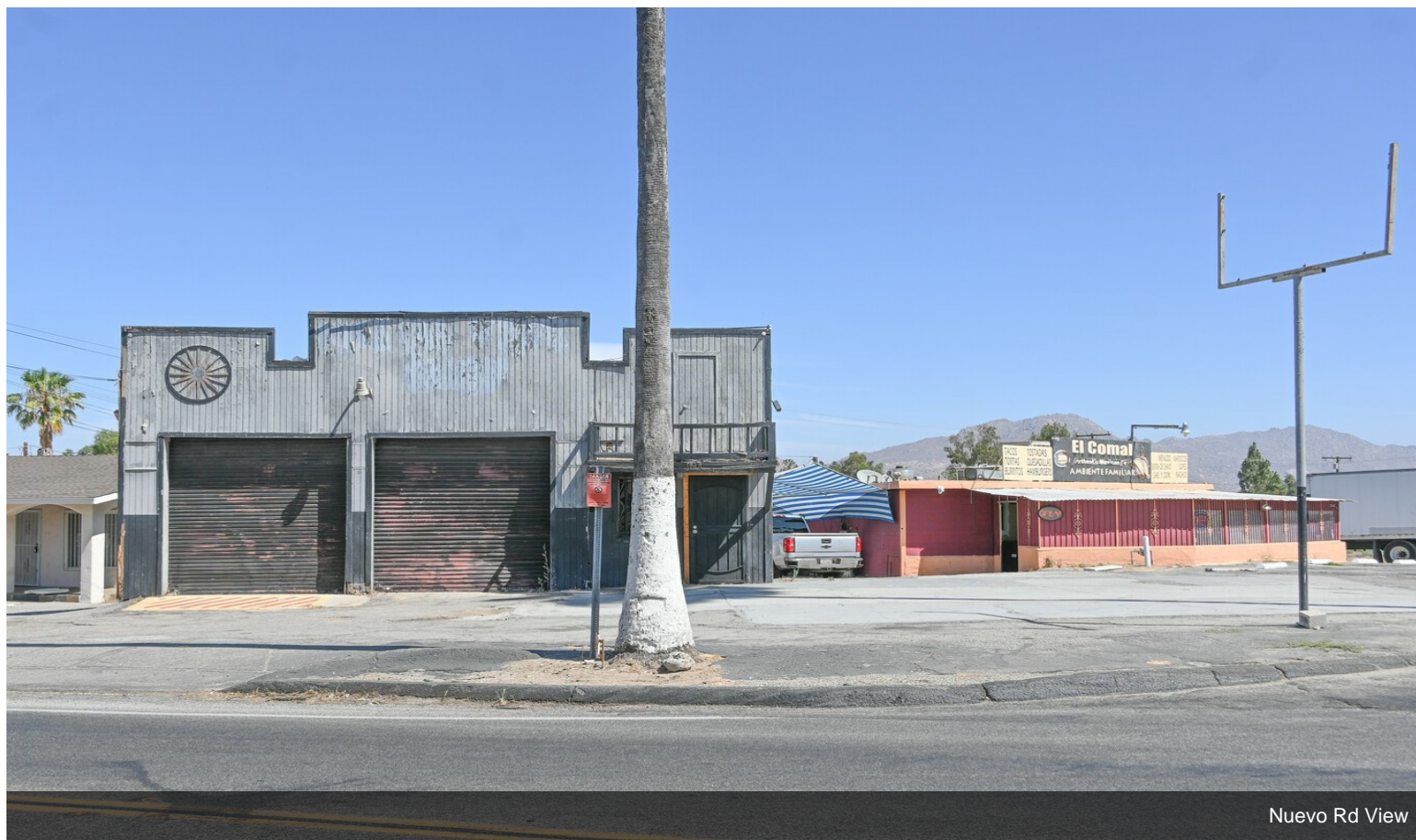
Nuevo Rd View