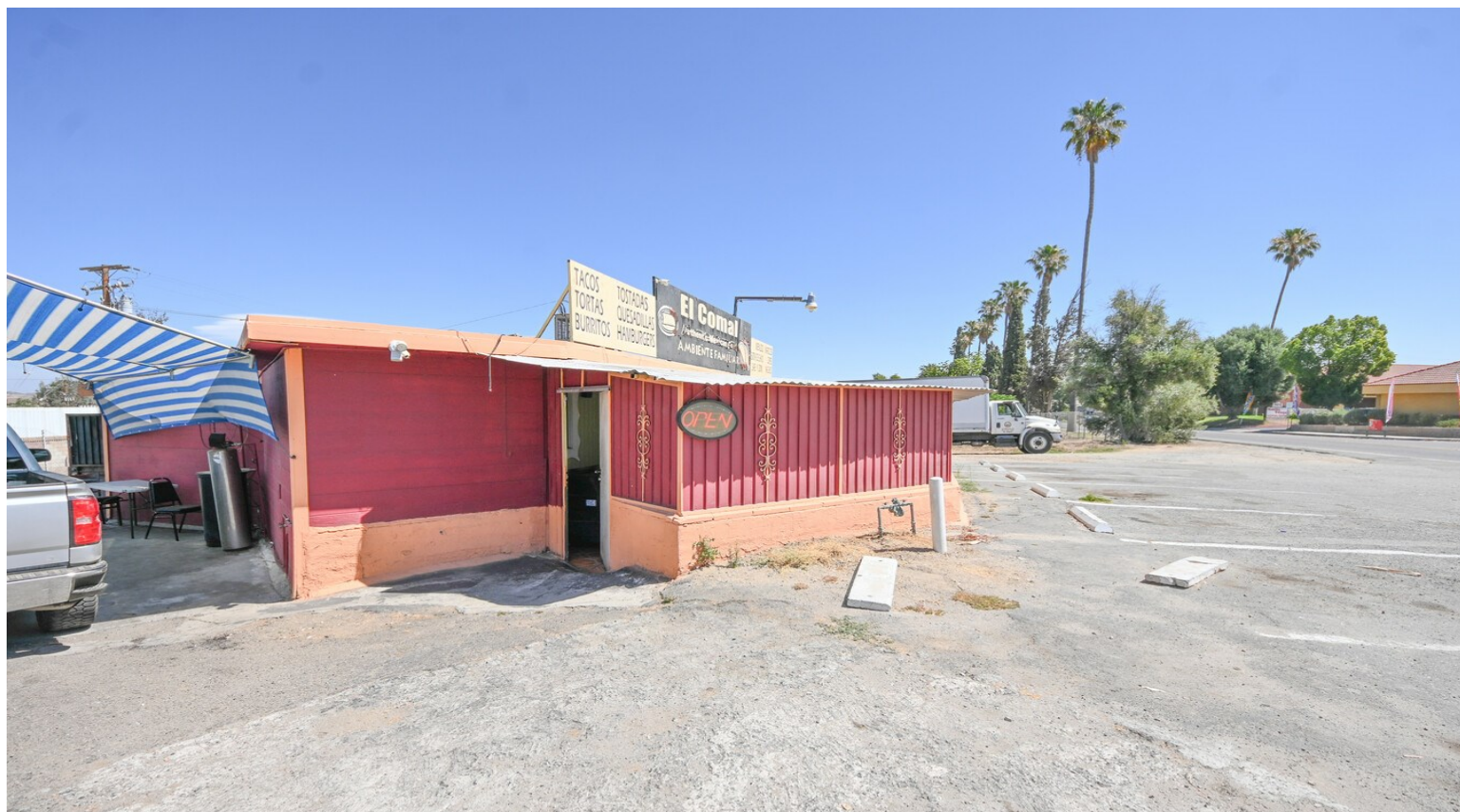
Side of Restaurant