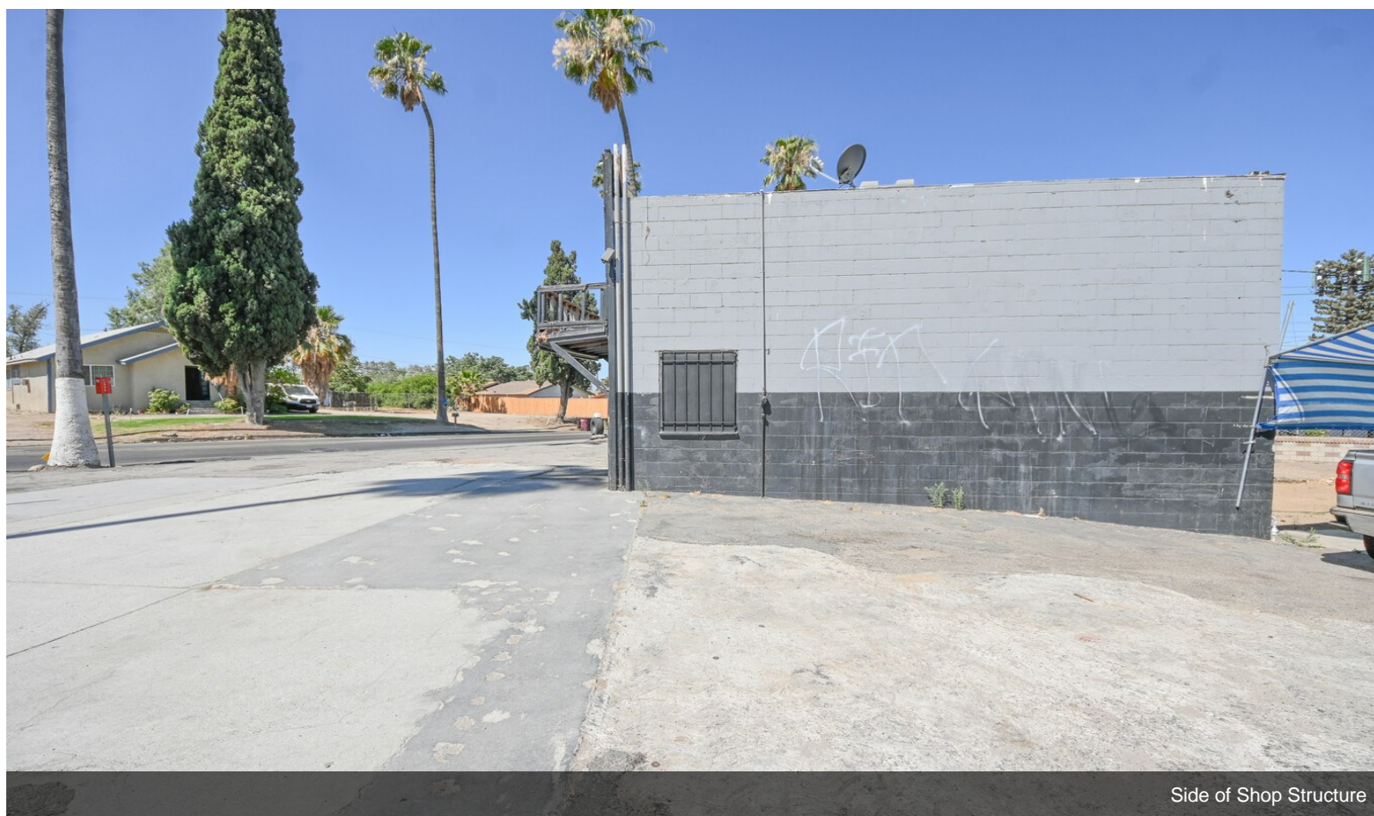
Side of Shop Structure