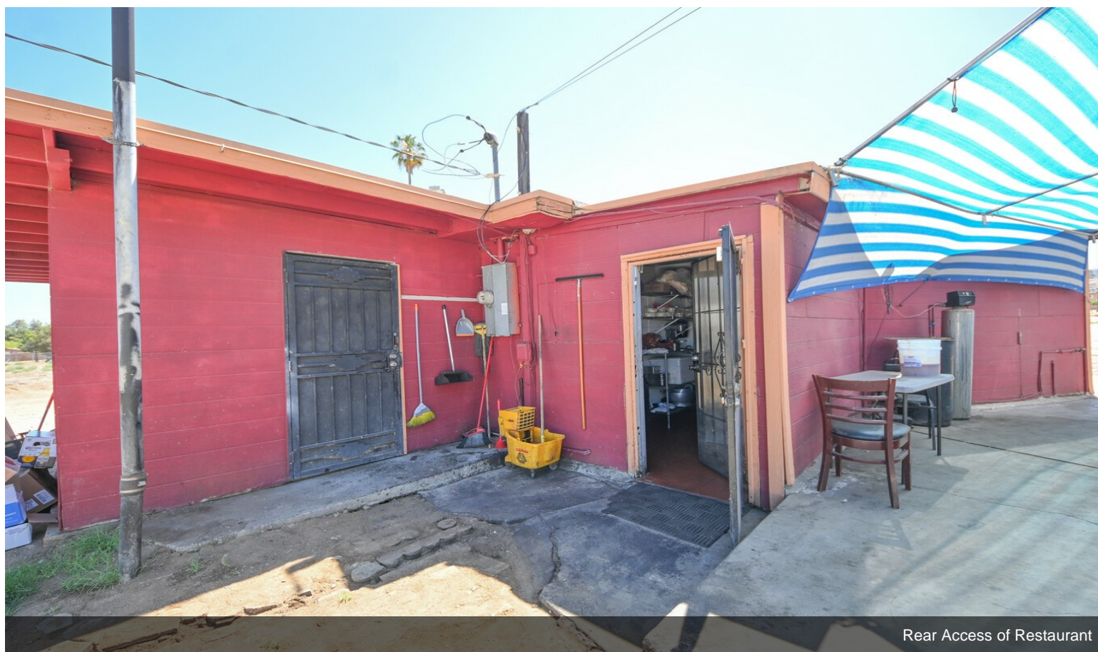
Rear Access of Restaurant