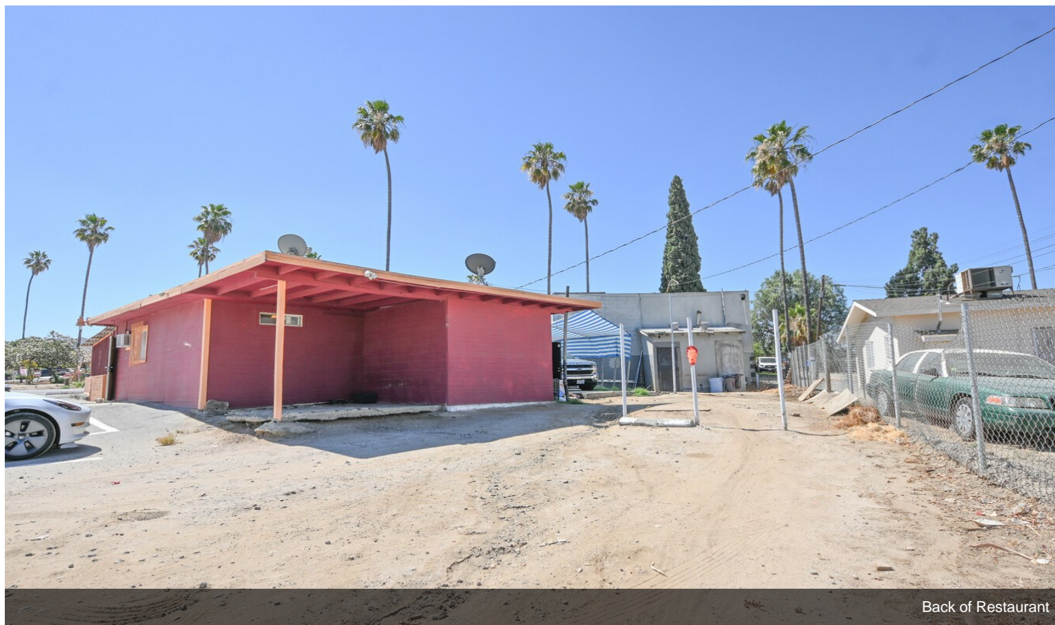
Back of Restaurant