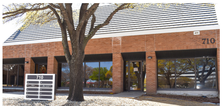
MONUMENT SIGNAGE AVAILABLE