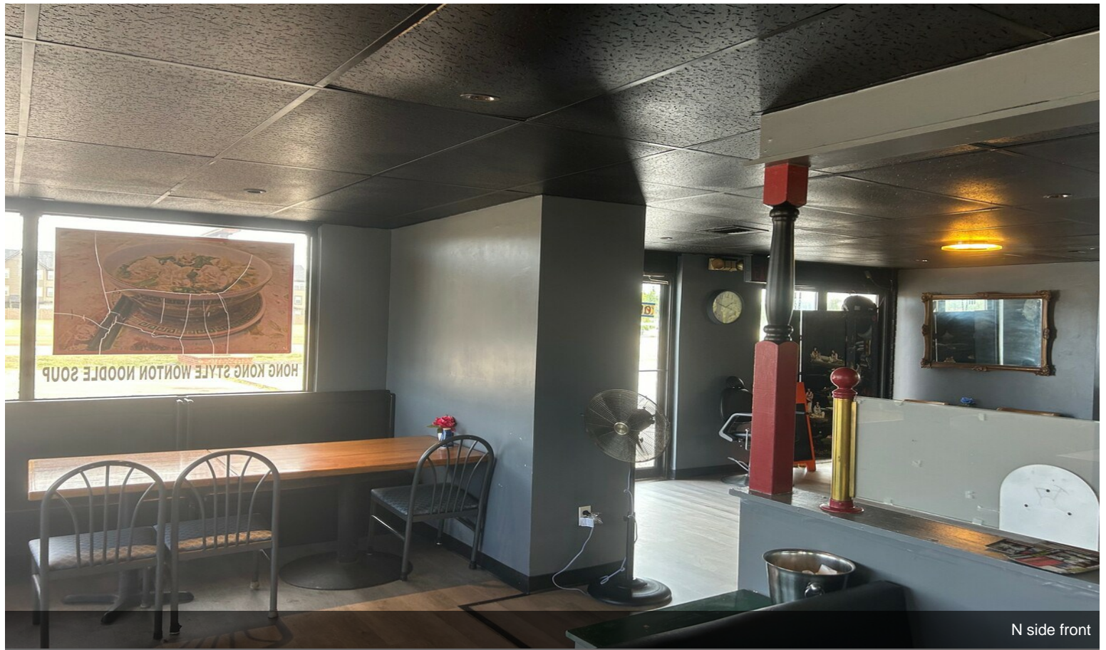
N side front