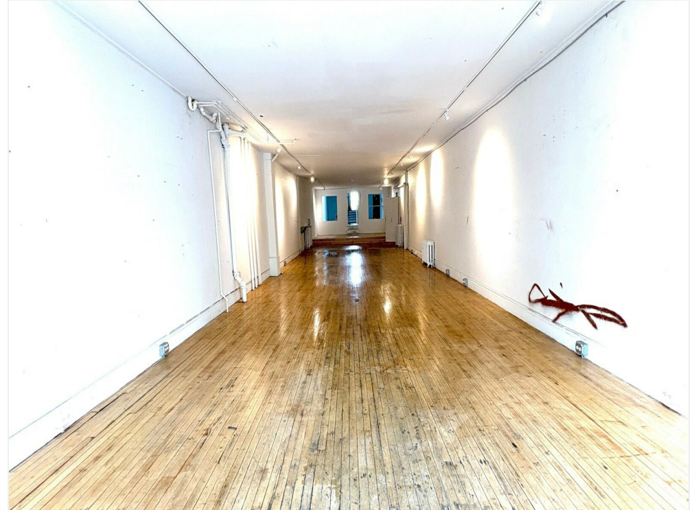
Front Showroom - Looking Rear