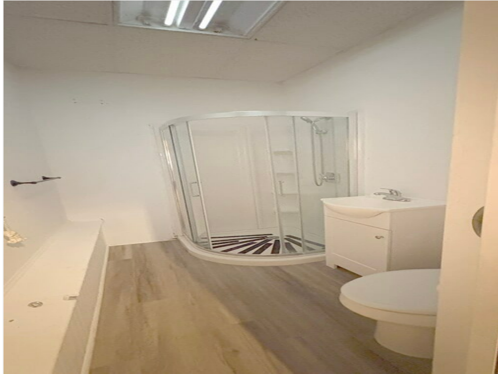
Side - Bathroom