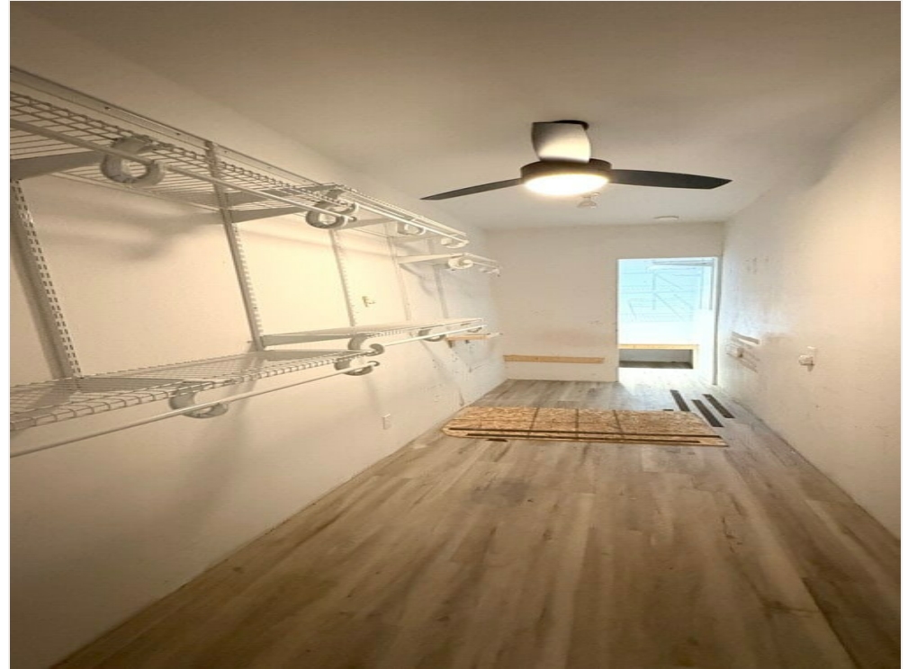
Side - Storage