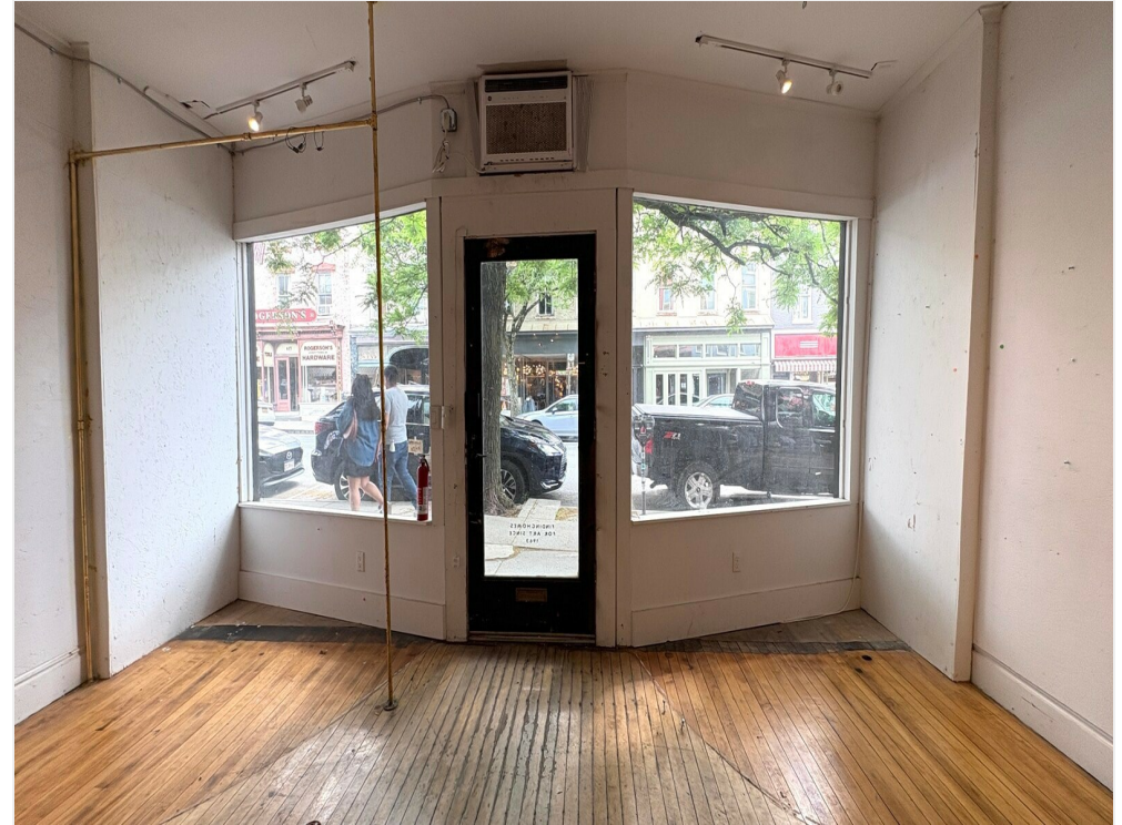
Front Showroom toward Warren St