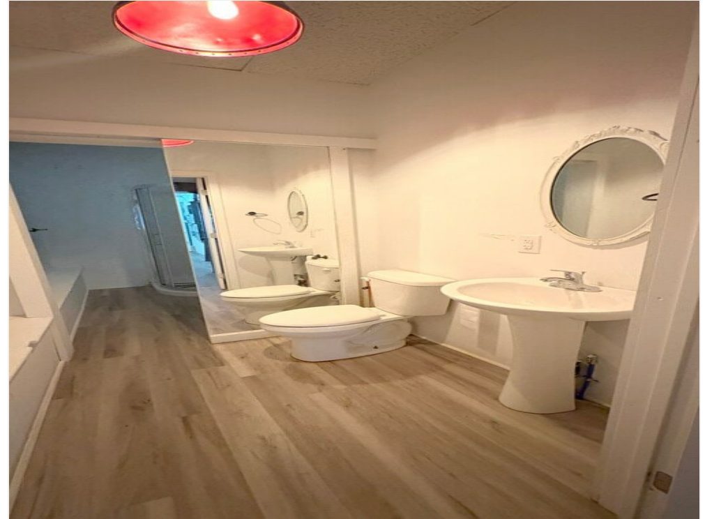
Side - Bathroom