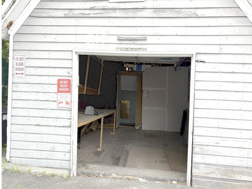
Attached Garage on Alley