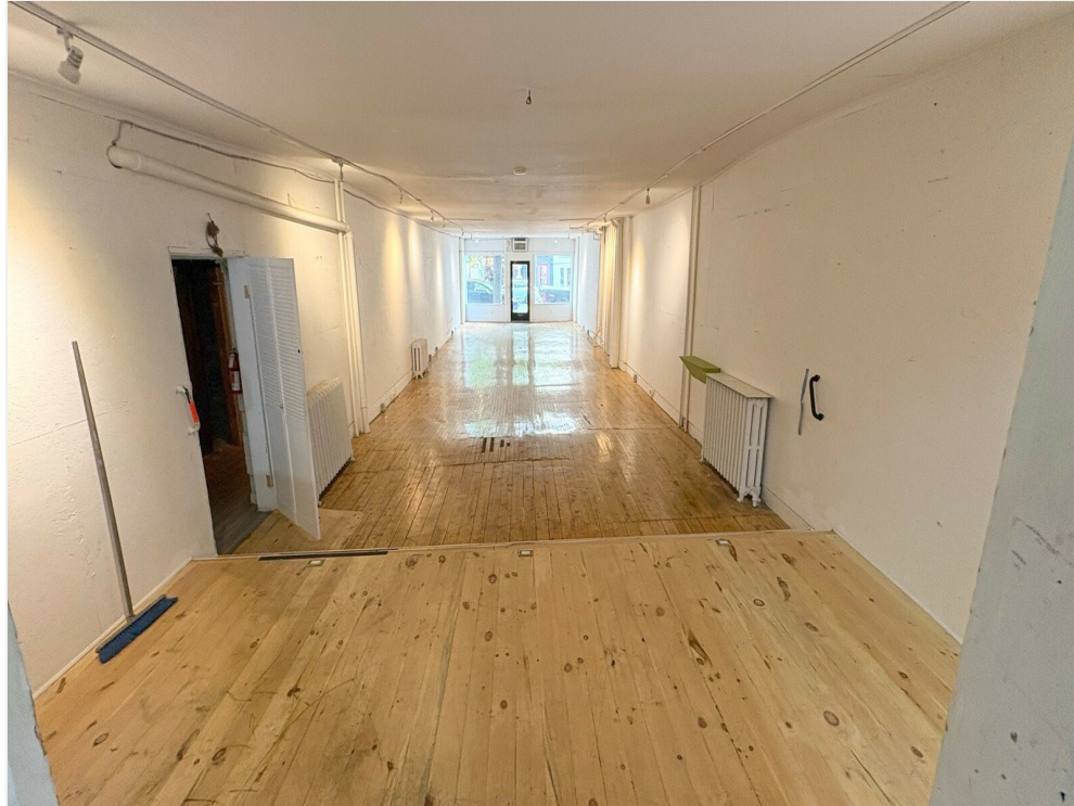
Mid-Showroom Looking toward Warren St