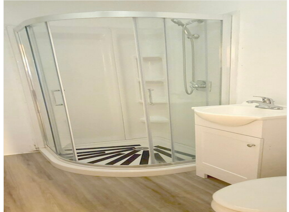
Side - Bathroom