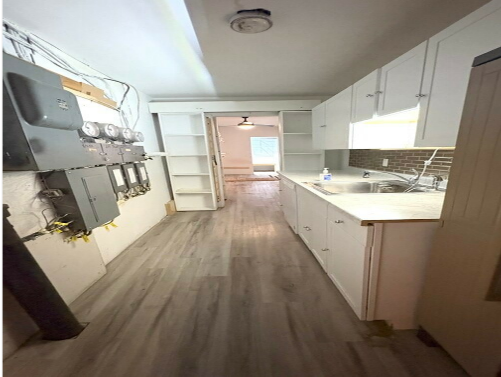
Side - Kitchen