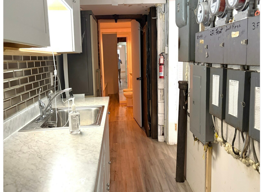
Side - Kitchen