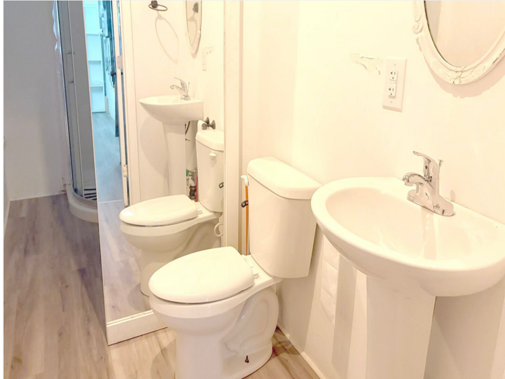
Side - Bathroom