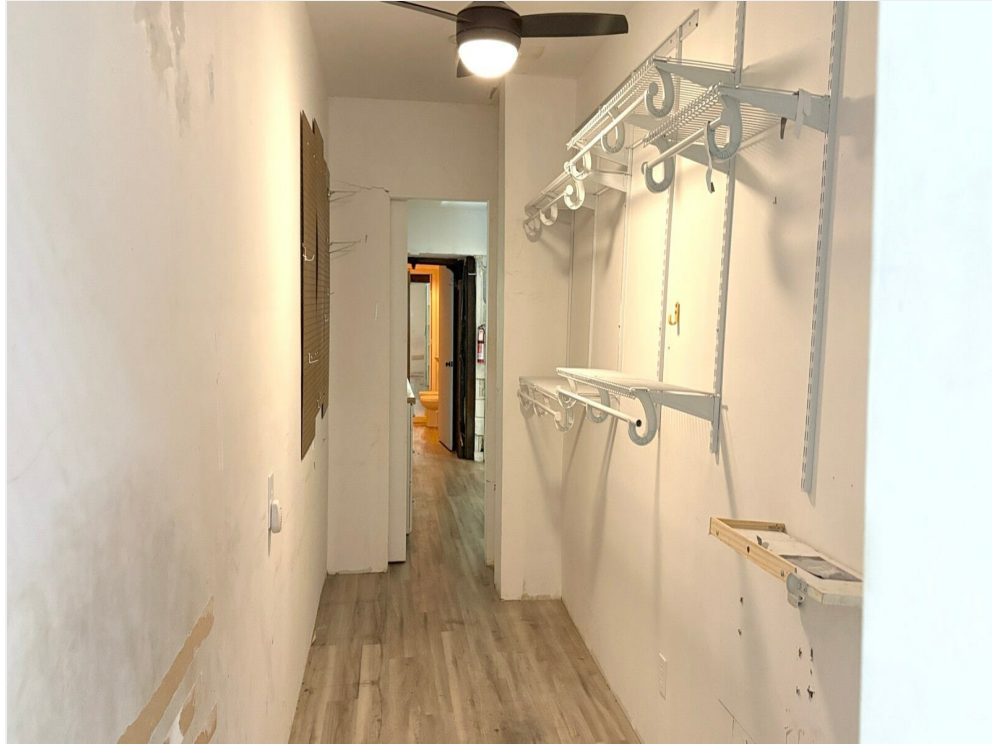
Side - Storage