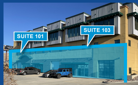
West Side of the Building