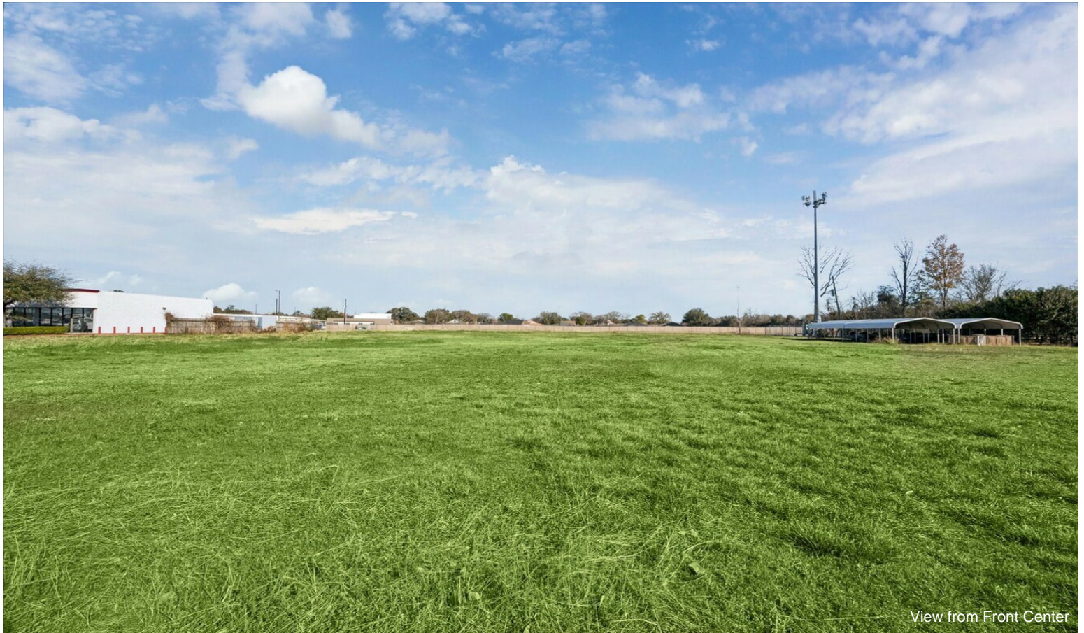
View from Front Center