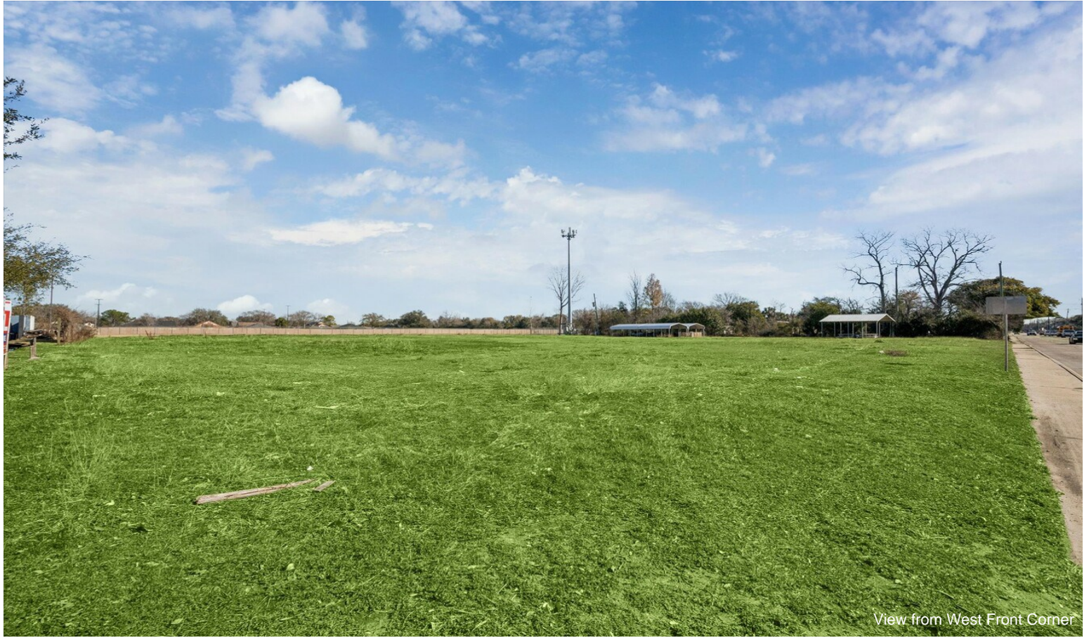
View from West Front Corner