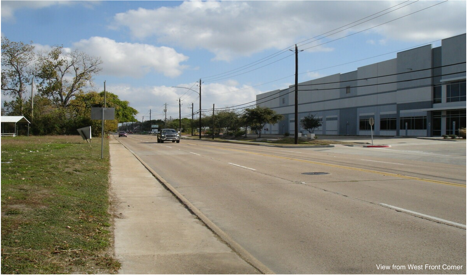
View from West Front Corner