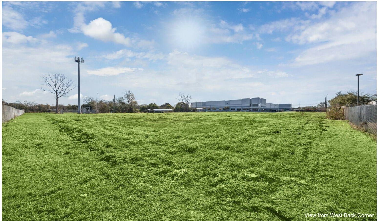
View from West Back Corner