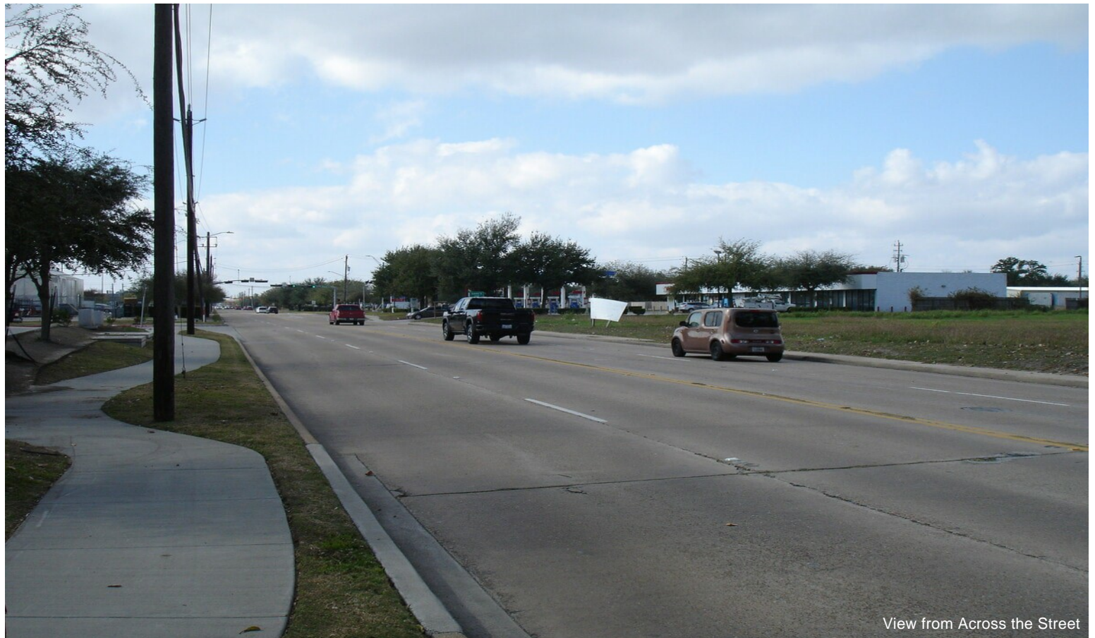
View from Across the Street