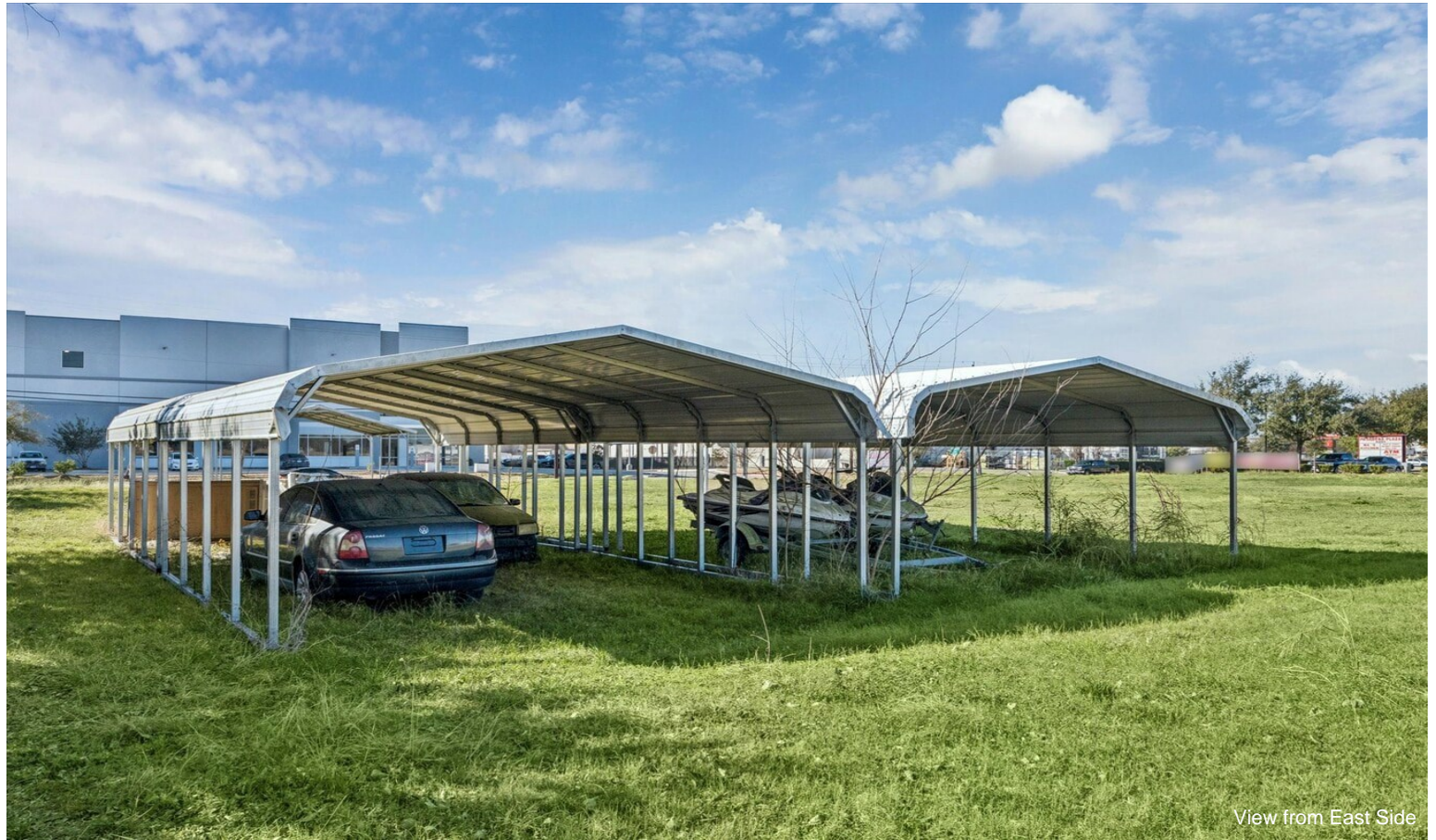
View from East Side