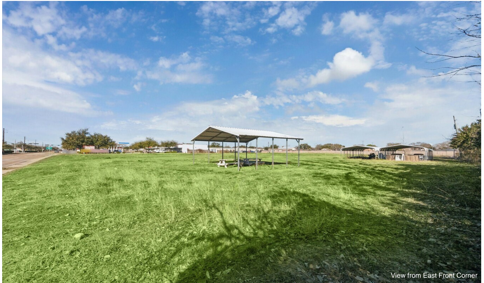
View from East Front Corner