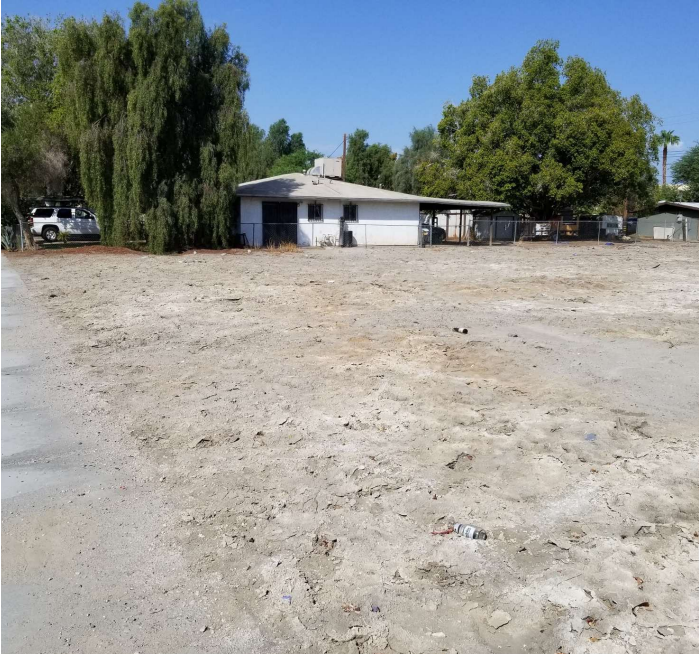
2nd Street Frontage and Adjacent Home

Palm Avenue & 2nd Street Coachella, CA 92236