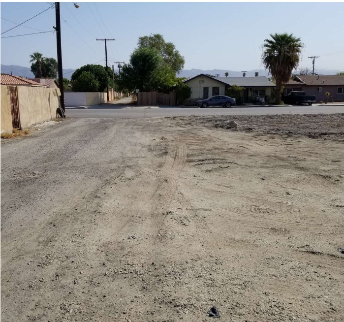
Palm Avenue and 2nd Street Alleyway & North Side of Lots