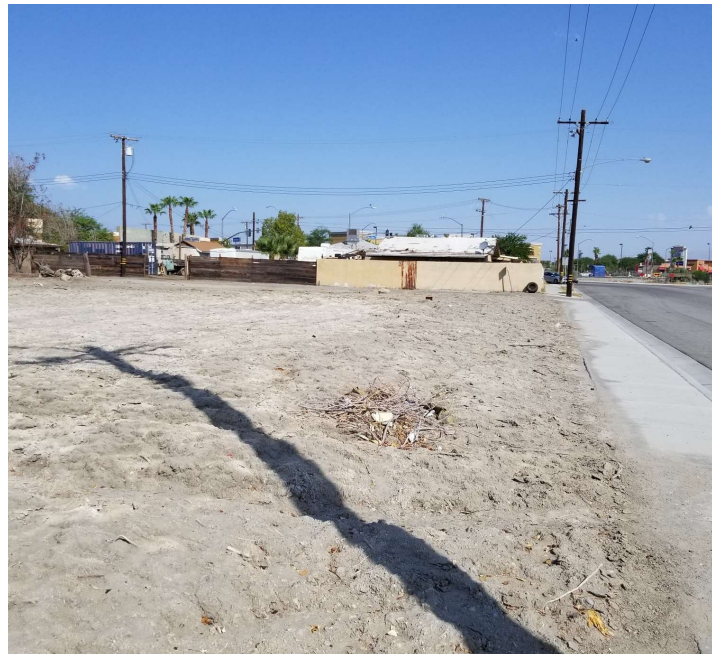
View to North along Palm Avenue from 2nd Street

Curtis Barlow (760) 899-7700 CalDRE #01380247