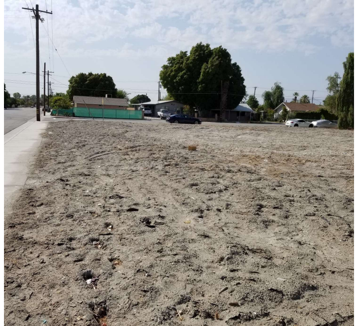
View South Along Palm Avenue