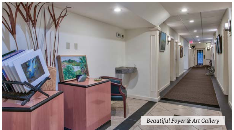
Beautiful Foyer & Art Gallery