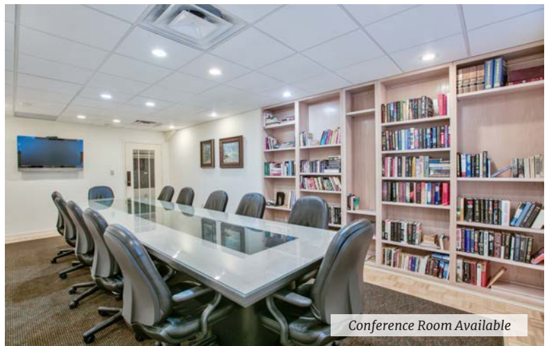
Conference Room Available