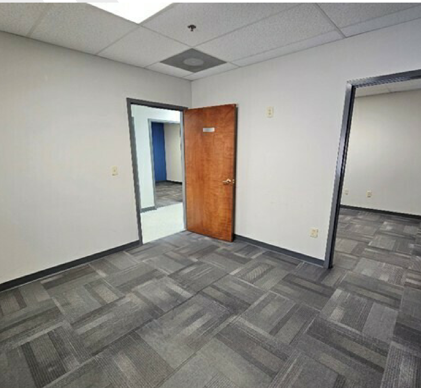
One of 7 offices