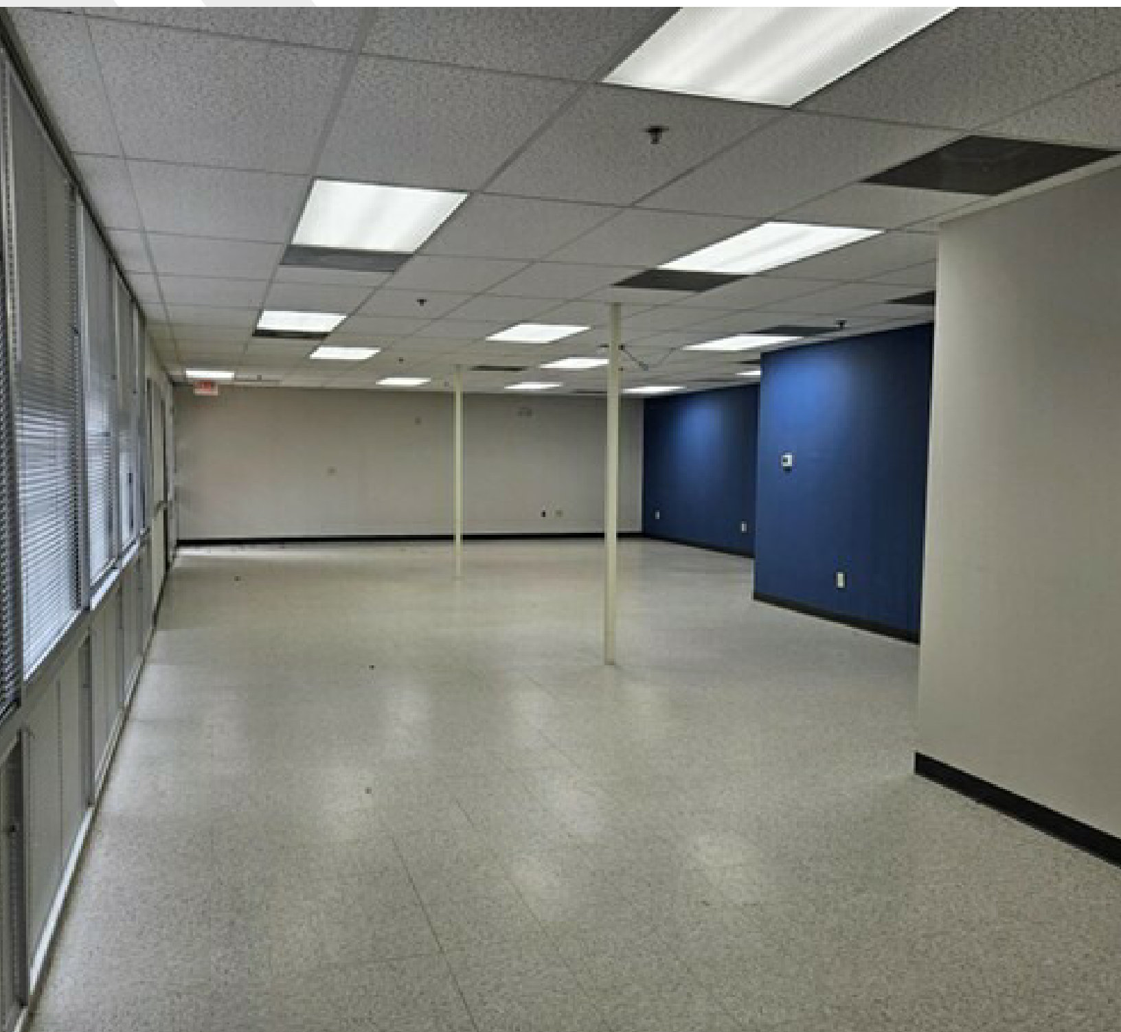
Large open front room