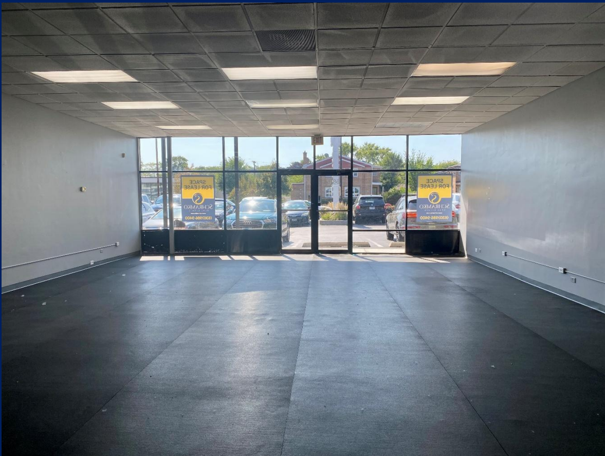
6847 N. Lincoln – 1,793 SF