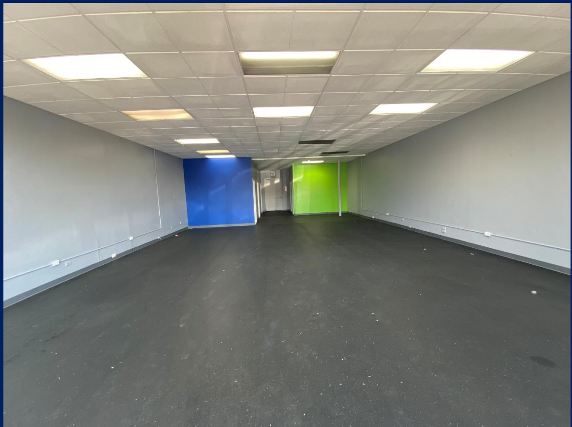
6847 N. Lincoln – 1,793 SF