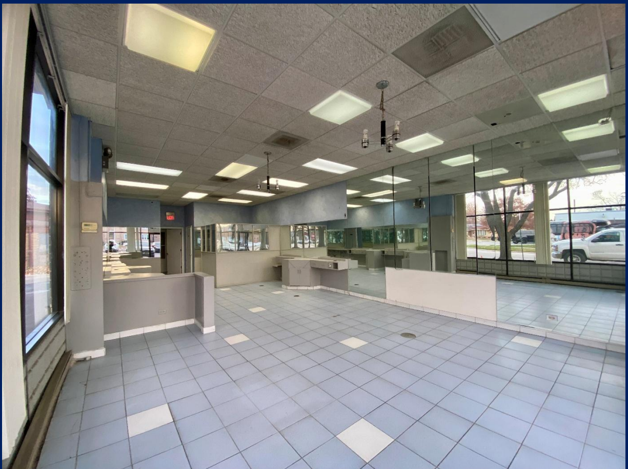
6849 N. Lincoln – 830 SF