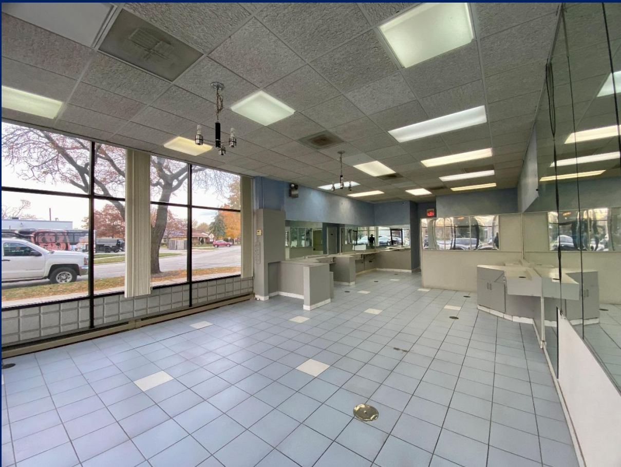
6849 N. Lincoln – 830 SF