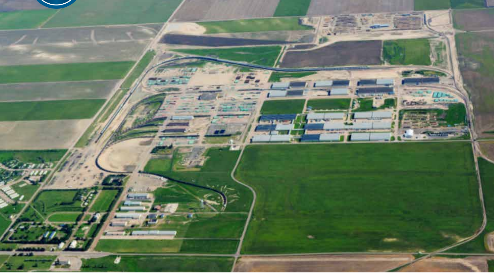
Trucking Times From Adams Industrial Park