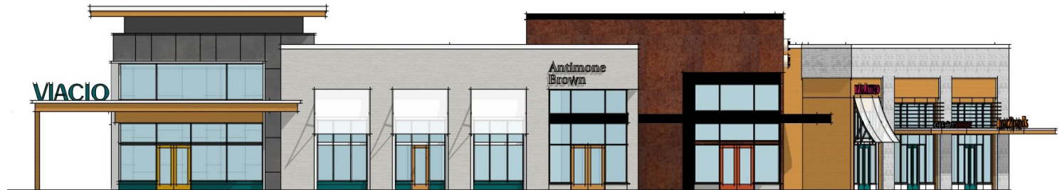
Narcoossee Rd. Frontage