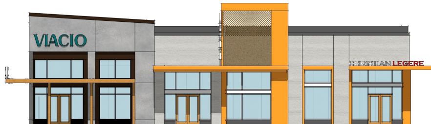
Building D Courtyard Frontage