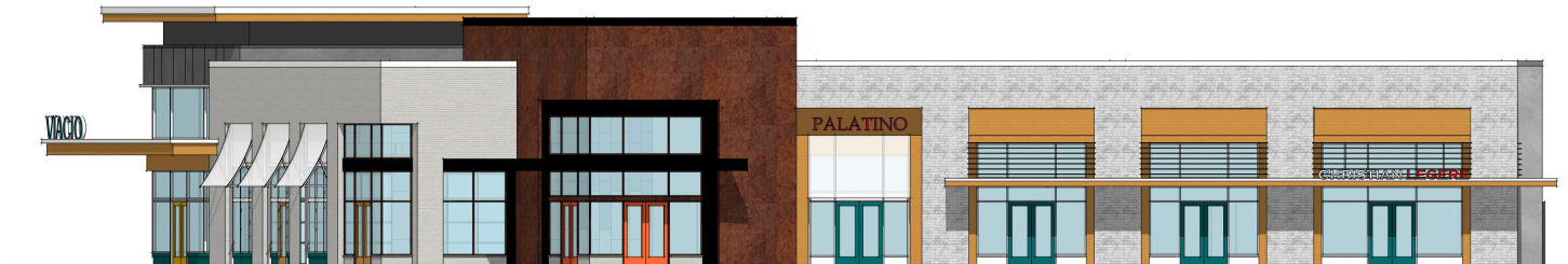
Narcoossee Rd. Frontage