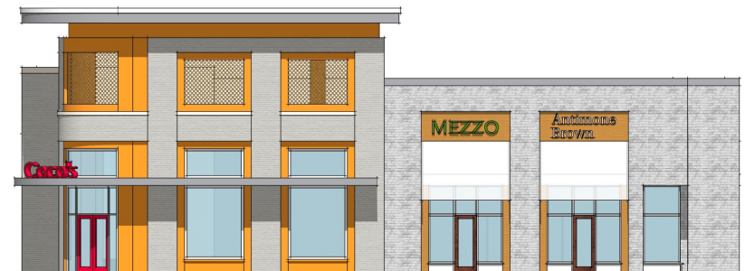
Building E Courtyard Frontage