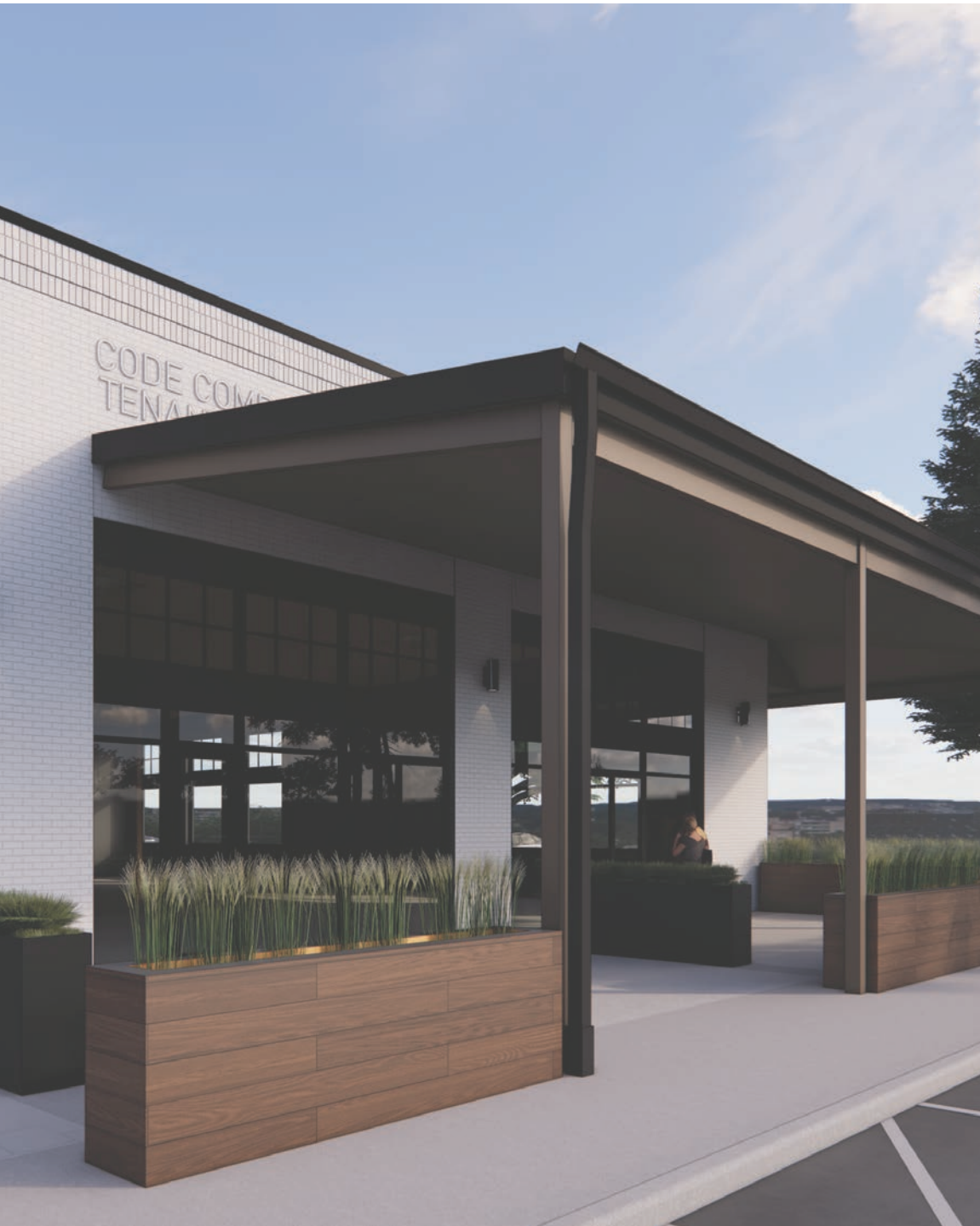
345 Lovers Lane