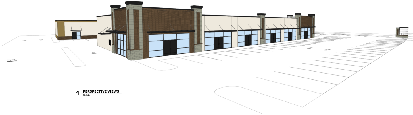
1 PERSPECTIVE VIEWS SCALE: