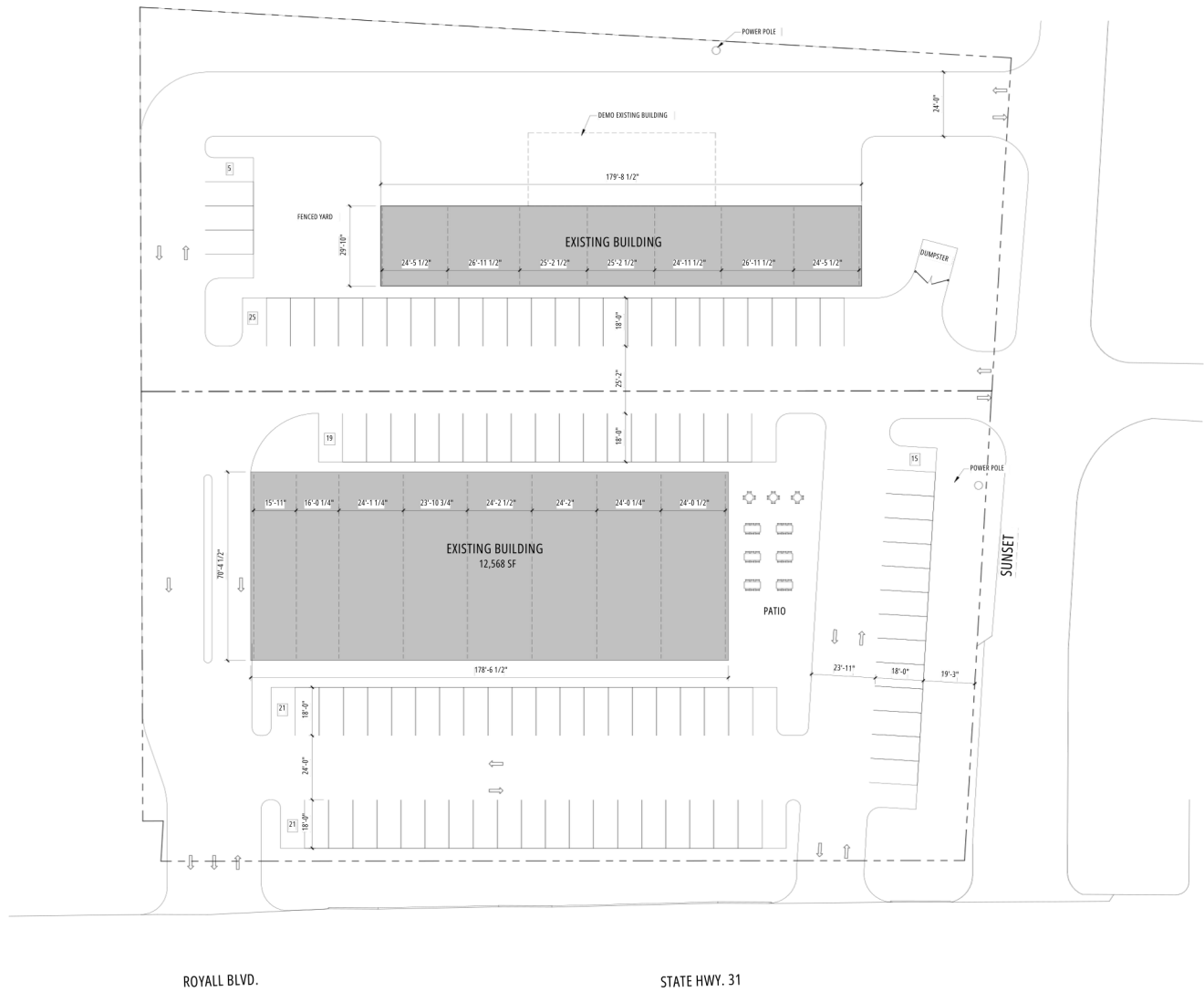
1 SITE PLAN SCALE: 1" = 20'-0" TOTAL PARKING AS DRAWN = 106