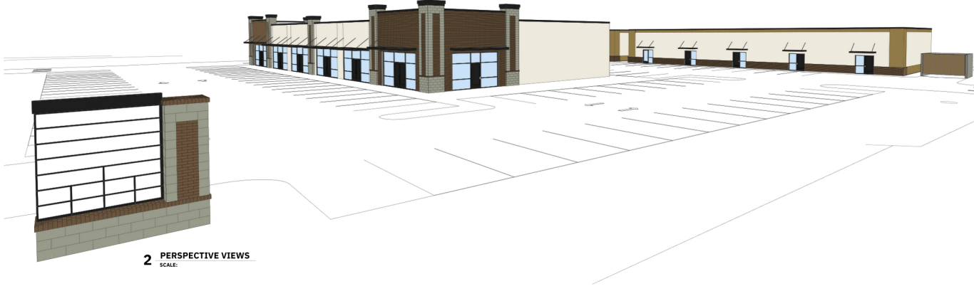
2 PERSPECTIVE VIEWS SCALE: