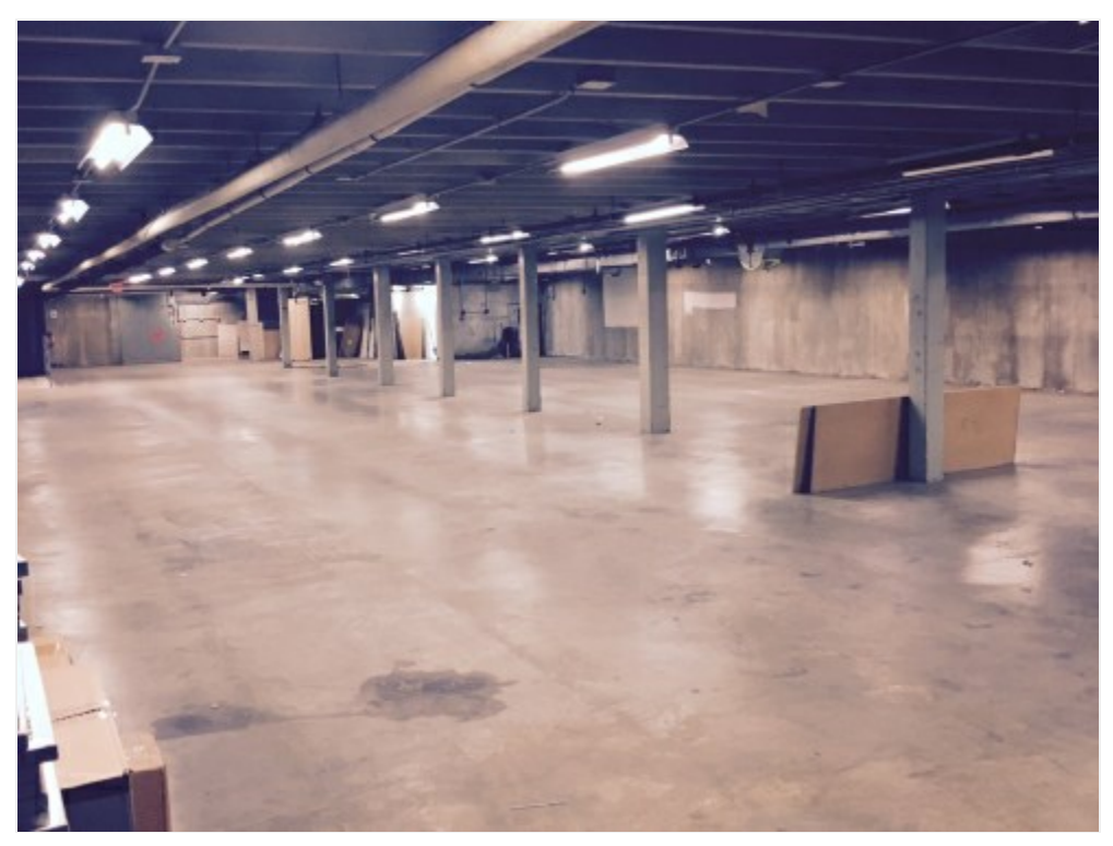
Basement - 6,600 s.f. - 8 ft ceiling