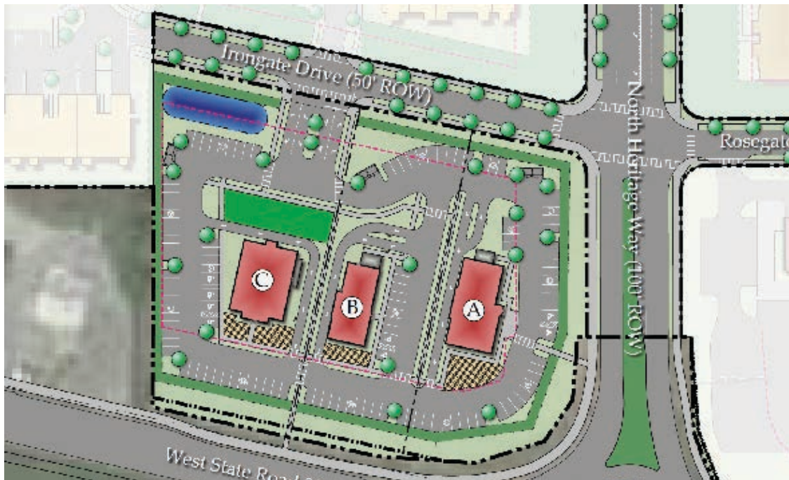
West Parcel - Outlots Available

Bailey Webber ■ 317-381-9333 ext. 111 ■ bwebber@equis.com equis.com ■ 8395 Keystone Crossing, Suite 215 ■ Indianapolis, IN 46240