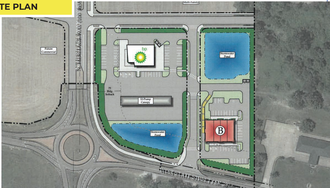
East Parcel - Building B - Multi-Tenant Building