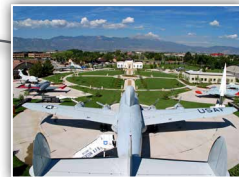
Peterson Space Force Base