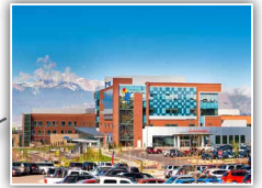
Children's Hospital Colorado