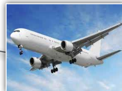
Colorado Springs Municipal Airport

The information contained herein, while from sources believed reliable, is not guaranteed and is subject to change without notice. NAI Affinity makes no warranties or representations as to the accuracy of this information. This brochure is the exclusive property of NAI Affinity. Any duplication without NAI Affinity's express written consent is prohibited.