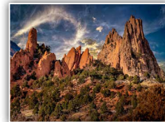
Garden of the Gods - National Natural Landmark