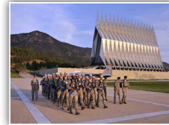
Air Force Academy