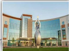
CommonSpirit St. Francis Hospital