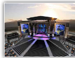
The Sunset- 8,000 seat outdoor amphitheater (2024)