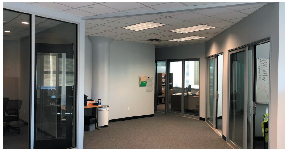
Generous Build-Out Allowances Available