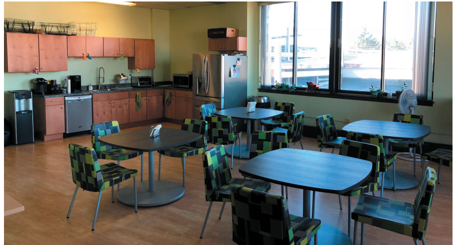
Various Office Configurations and Floor Plan Layouts