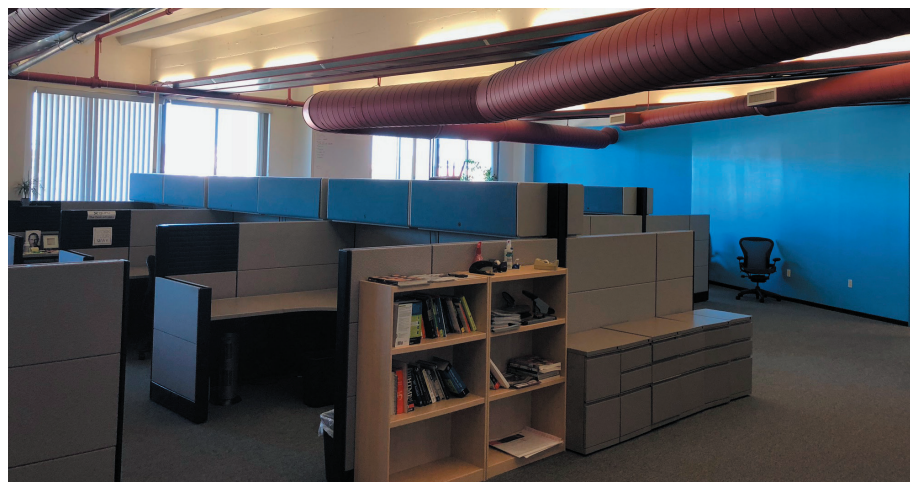
Professional Contemporary Office Schemes