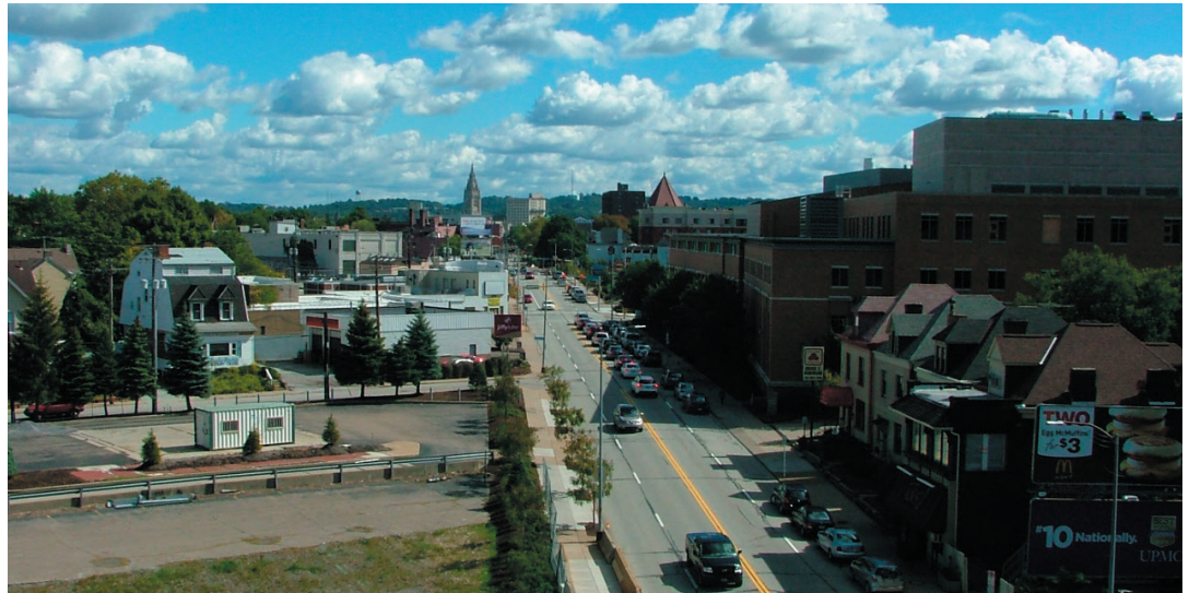
View of East End on Baum Boulevard from The Design Center.

For inquiries or to arrange a site visit, contact: