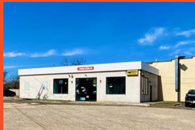
2547 DELSEA DR