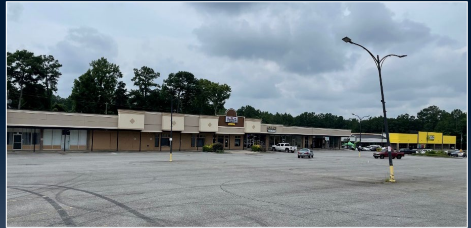
SHURLINGTON PLAZA, Macon, GA