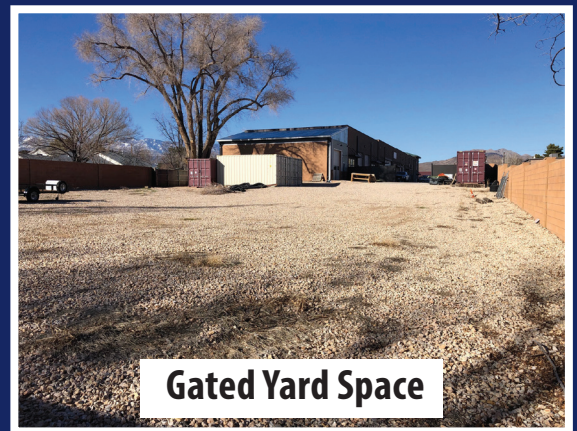
Gated Yard Space