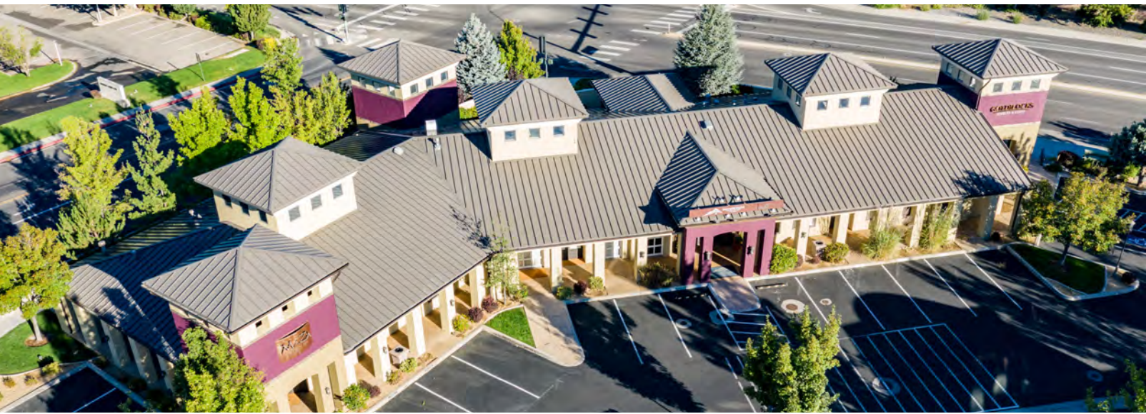
Moxie M3 Building