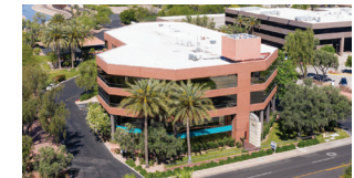
7250 7250 N 16th St Phoenix, AZ 85020