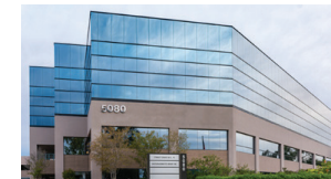
5080 5080 N 40th St Phoenix, AZ 85018