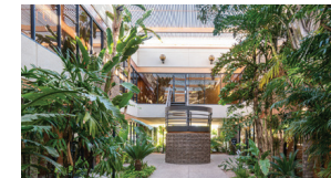
Alma School 1745 & 1811 S Alma School Rd Mesa, AZ 85210