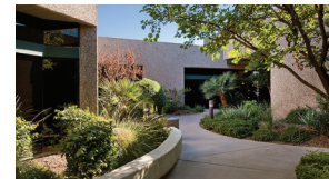
SOP 3923-4041 S McClintock Rd Tempe, AZ 85282