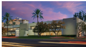
2141 2141 E Camelback Rd Phoenix, AZ 85016

Office: 602 - 956 - 2200 Cell: 480 - 297 - 9481