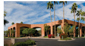
4040 4040 E Camelback Rd Phoenix, AZ 85018