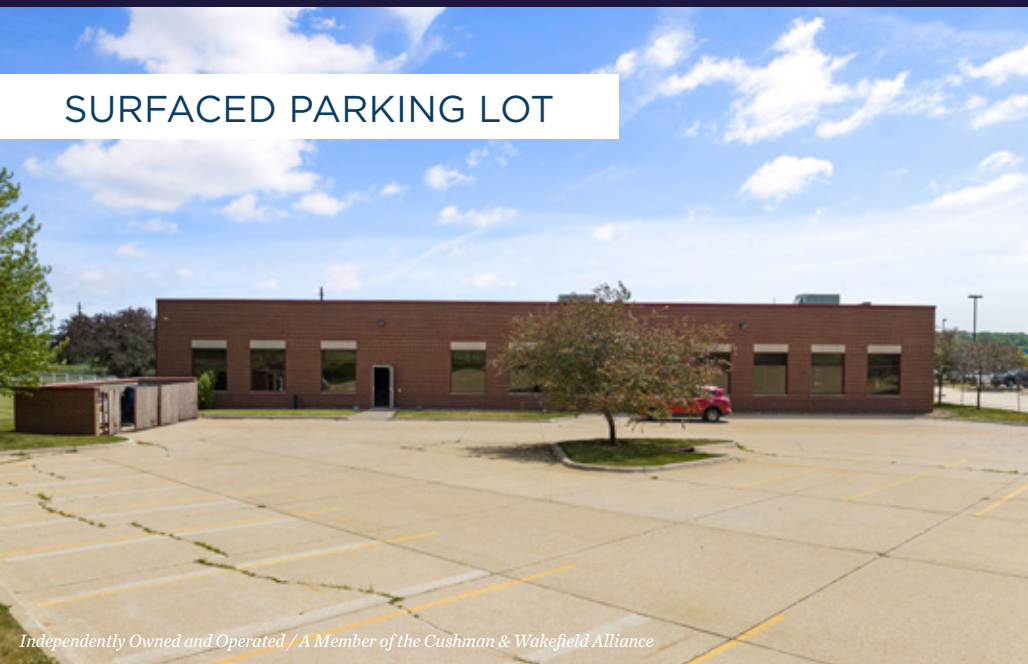
SURFACED PARKING LOT