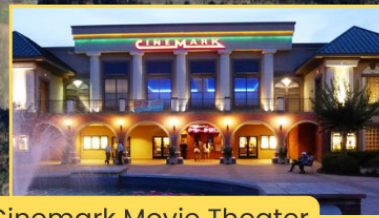
Cinemark Movie Theater