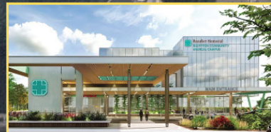
Beaufort Memorial Hospital Under Construction

St. Joseph's Candler's Bluffton Medical Campus, Urgent Care Center, Ace Hardware, Bluffton Police Department, Kroger, Publix, Culinary Institute of the Lowcountry