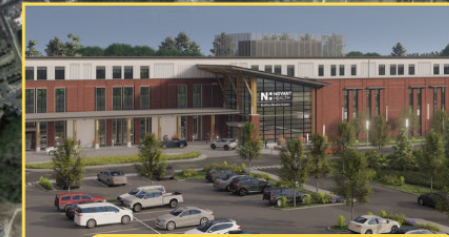
Novant Health Hospital In Permitting