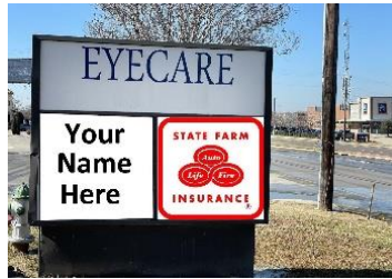
Highly Visible Lighted Double Sided Monument