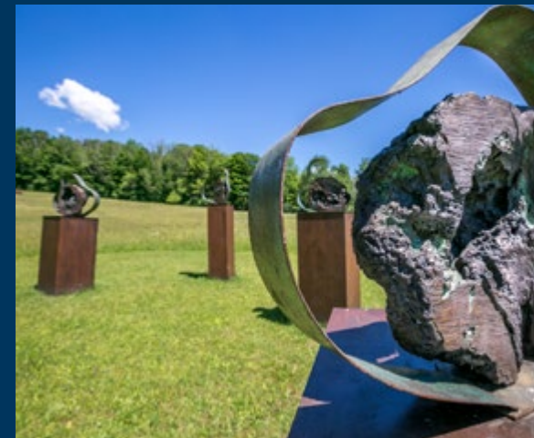
Southern Vermont Arts Center