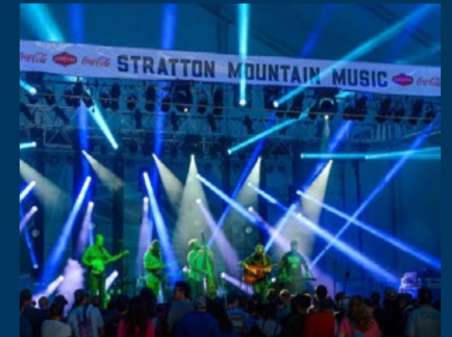
Live Music at Stratton Mountain