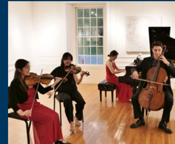
Manchester Music Festival