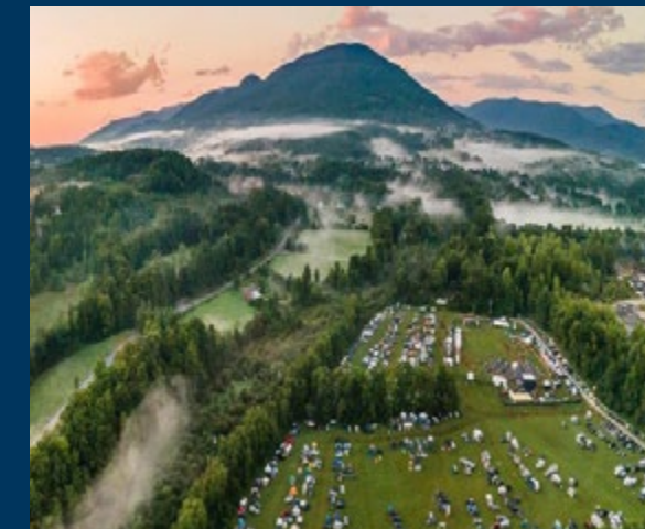
Riley Rink Concert Series