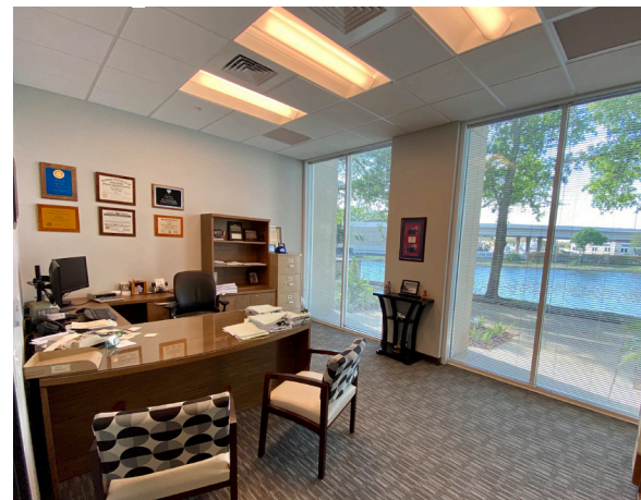
CLOCKWISE FROM TOP: On-Site Cafe // Lobby // Executive office // Conference room // Front entrance to building