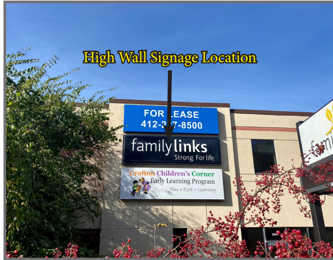
High Wall Signage Location