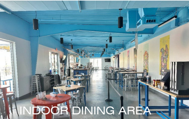
INDOOR DINING AREA