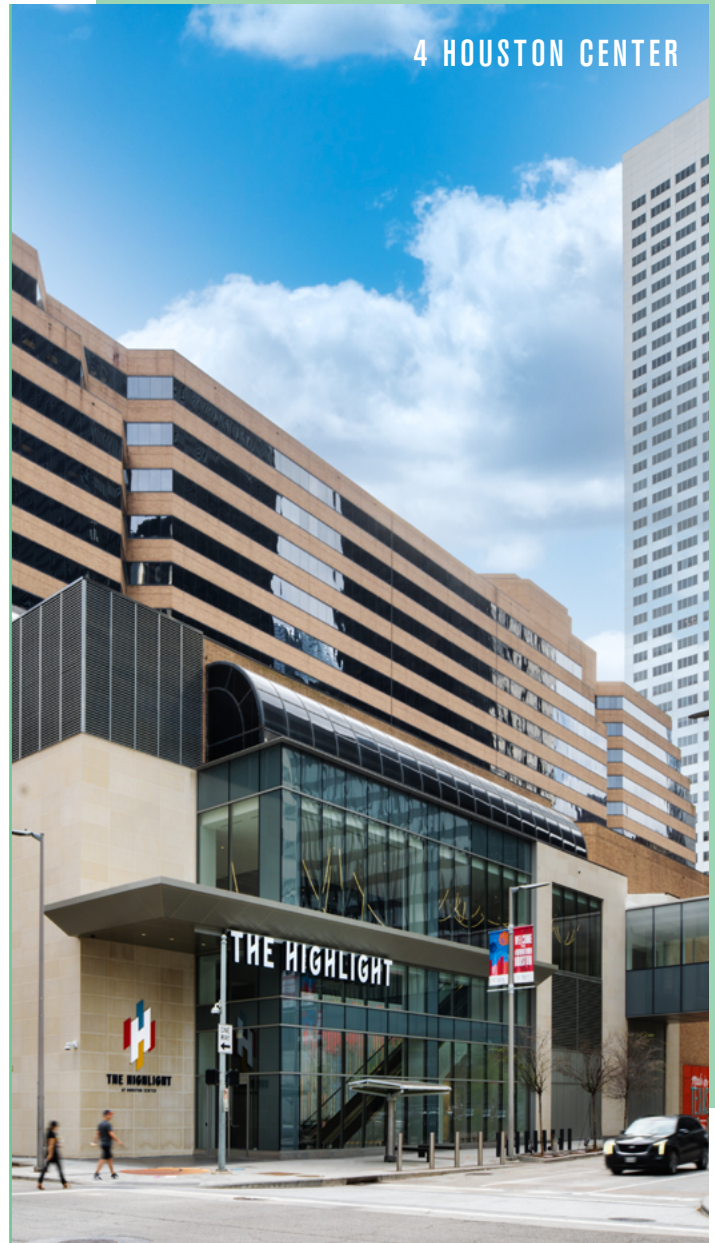
4 HOUSTON CENTER