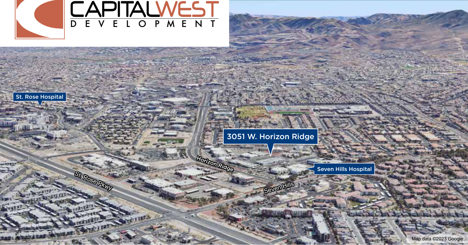
Map data ©2023 Google